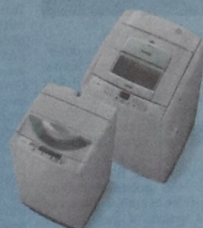
HITACHI Washing machine