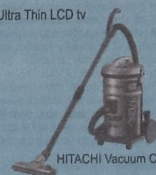
HITACHI Vacuum Cleaner