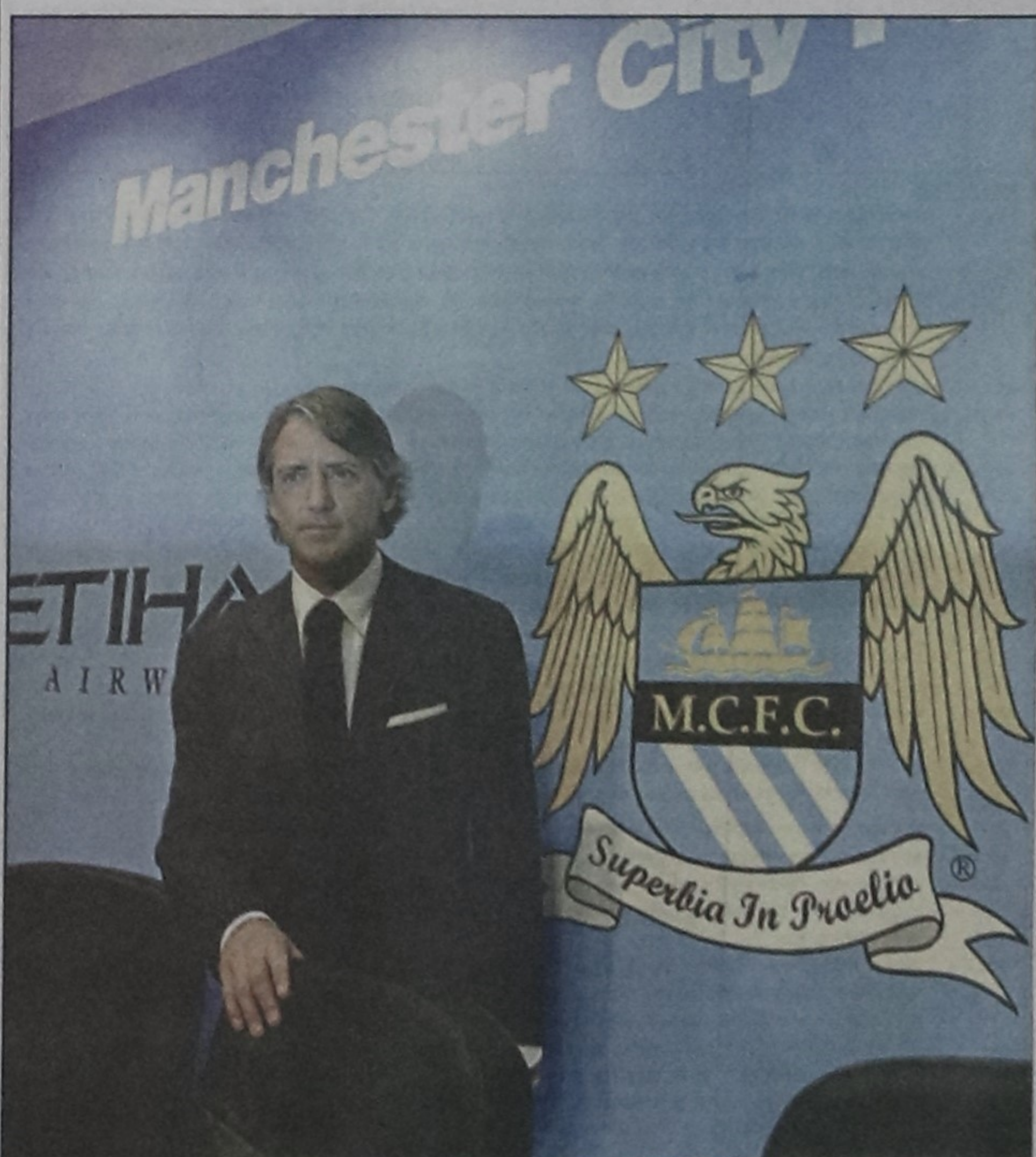
Manchester City's new manager Roberto Mancini turns up for a press conference at the City of Manchester Stadium on Monday.

The SFA has indicated that it wants to have the new manager in place before the draw for the qualifying tournament for Euro 2012 is made on February 7.