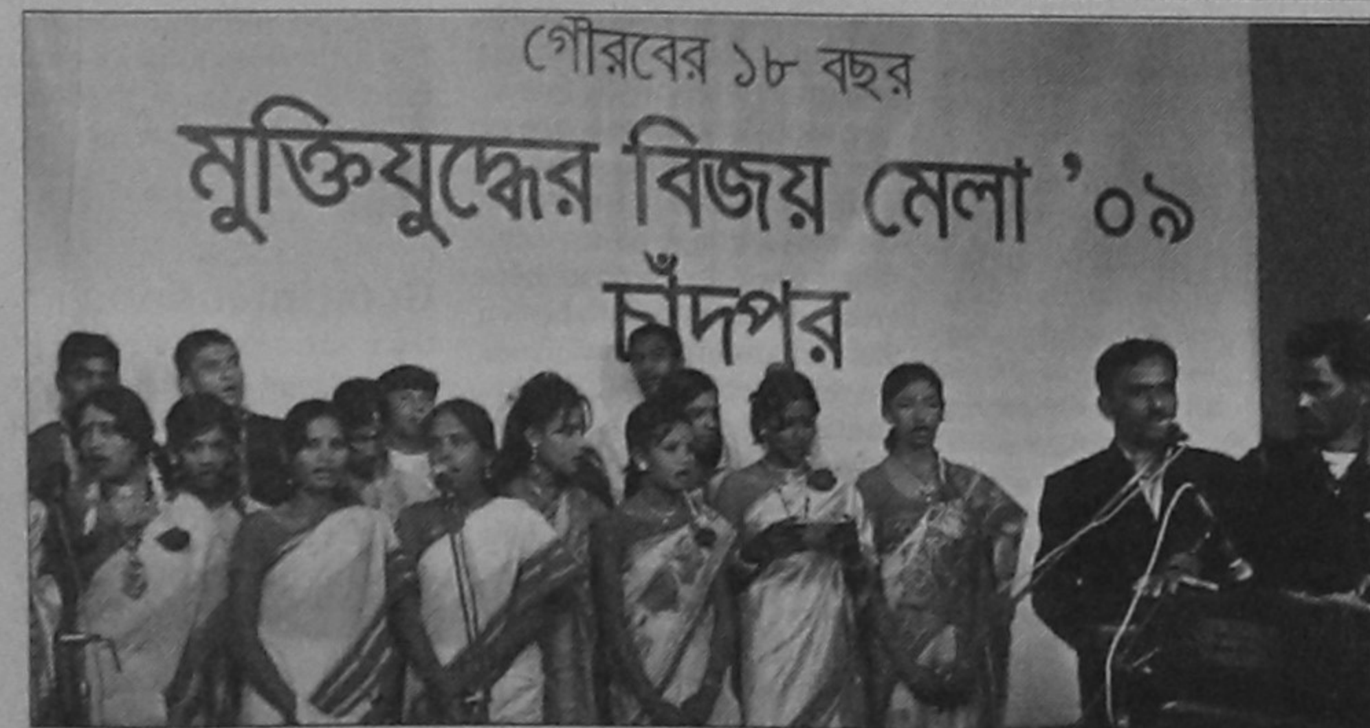
Artists belonging to the Harijan community perform at Muktijuddher Bijoy Mela in Chandpur that was arranged marking the month of victory.