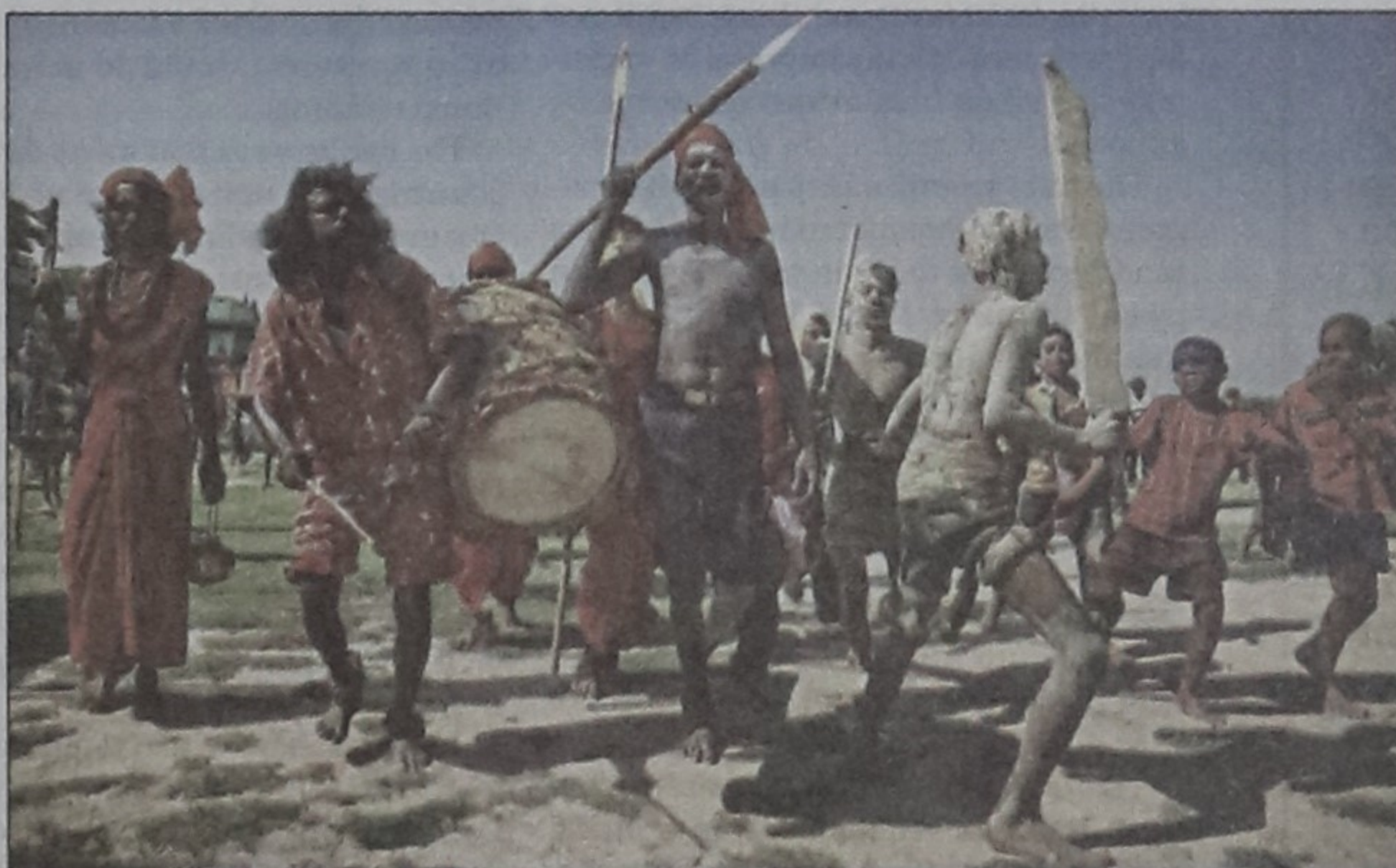
Boishakhi Utshab at Paril, Manikganj.

The photographs mostly feature the hilly region of the country, in particular distant parts of