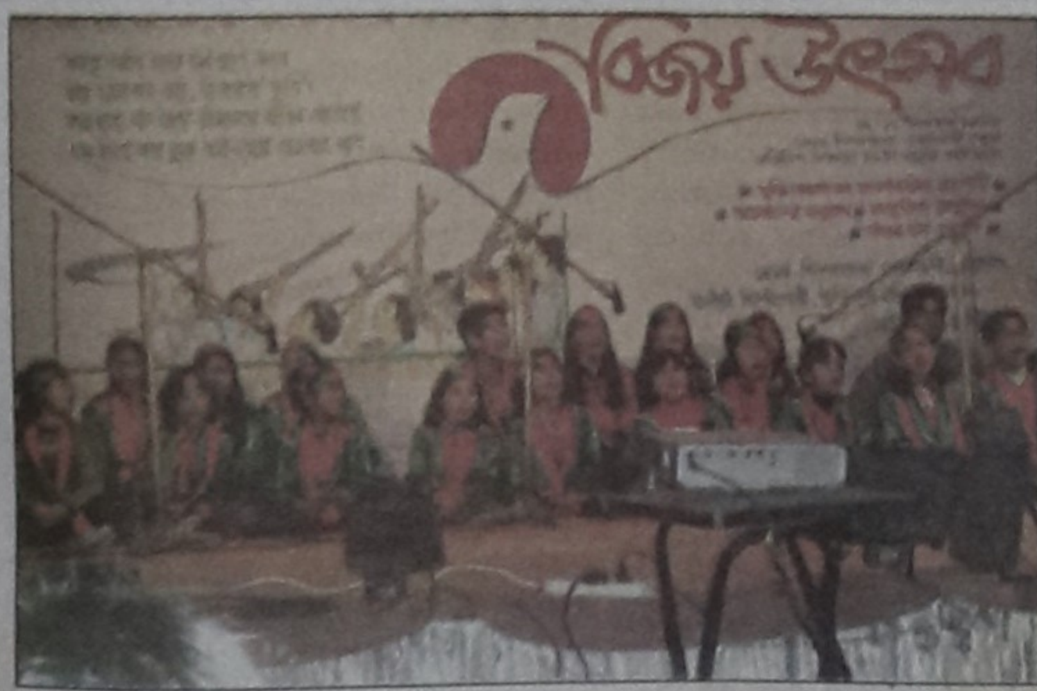
A group performance at the event.