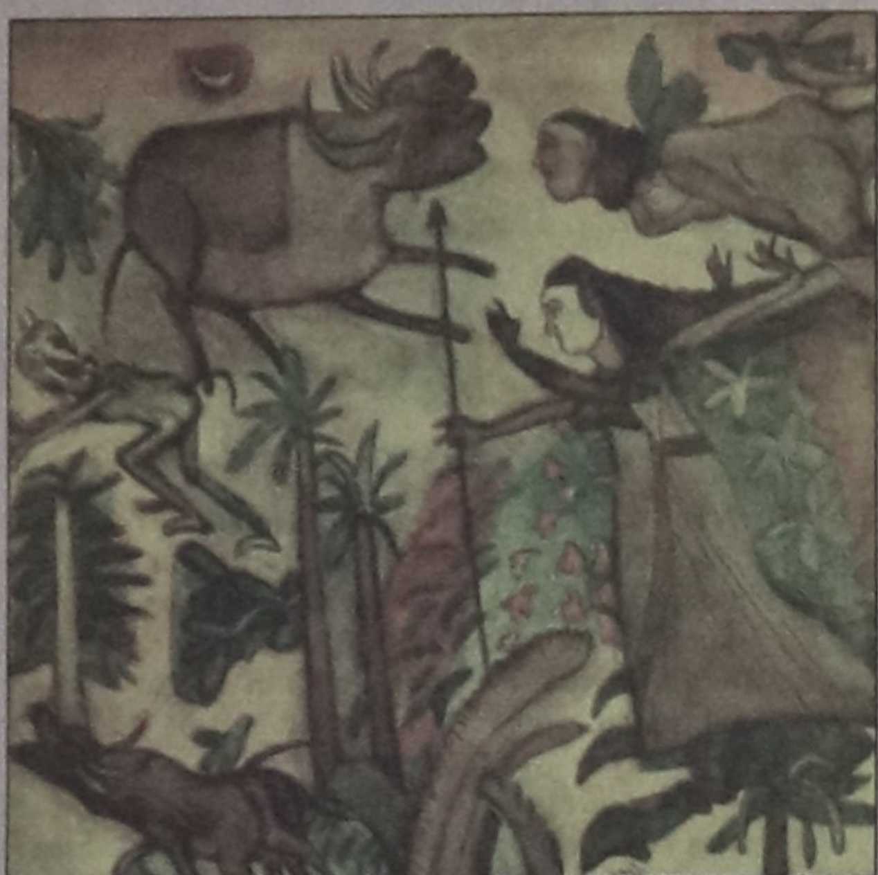
A painting by Subramanyan.

maestro will also give a speech on contemporary art on January 2, 2010 at Special Conference Hall of Nabab Nawab Ali Chowdhury Senate Building, University of Dhaka. Subramanyan will also visit the Liberation War Museum, National Museum, Fine Arts Department, Chittagong University, Paharpur in Bogra, among other places.