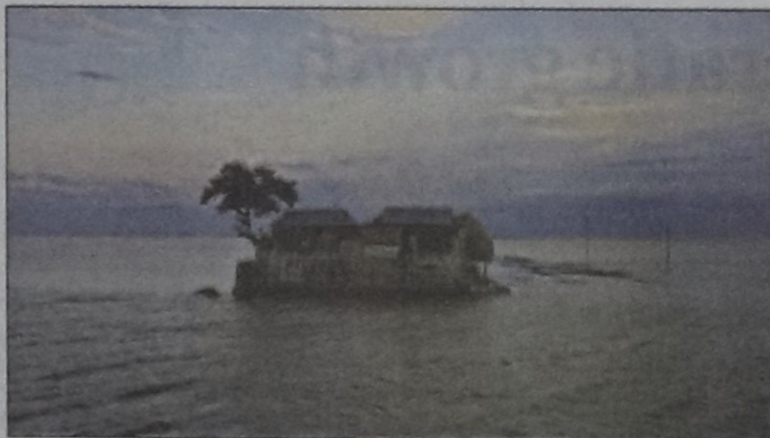
Baniachang in Habiganj.