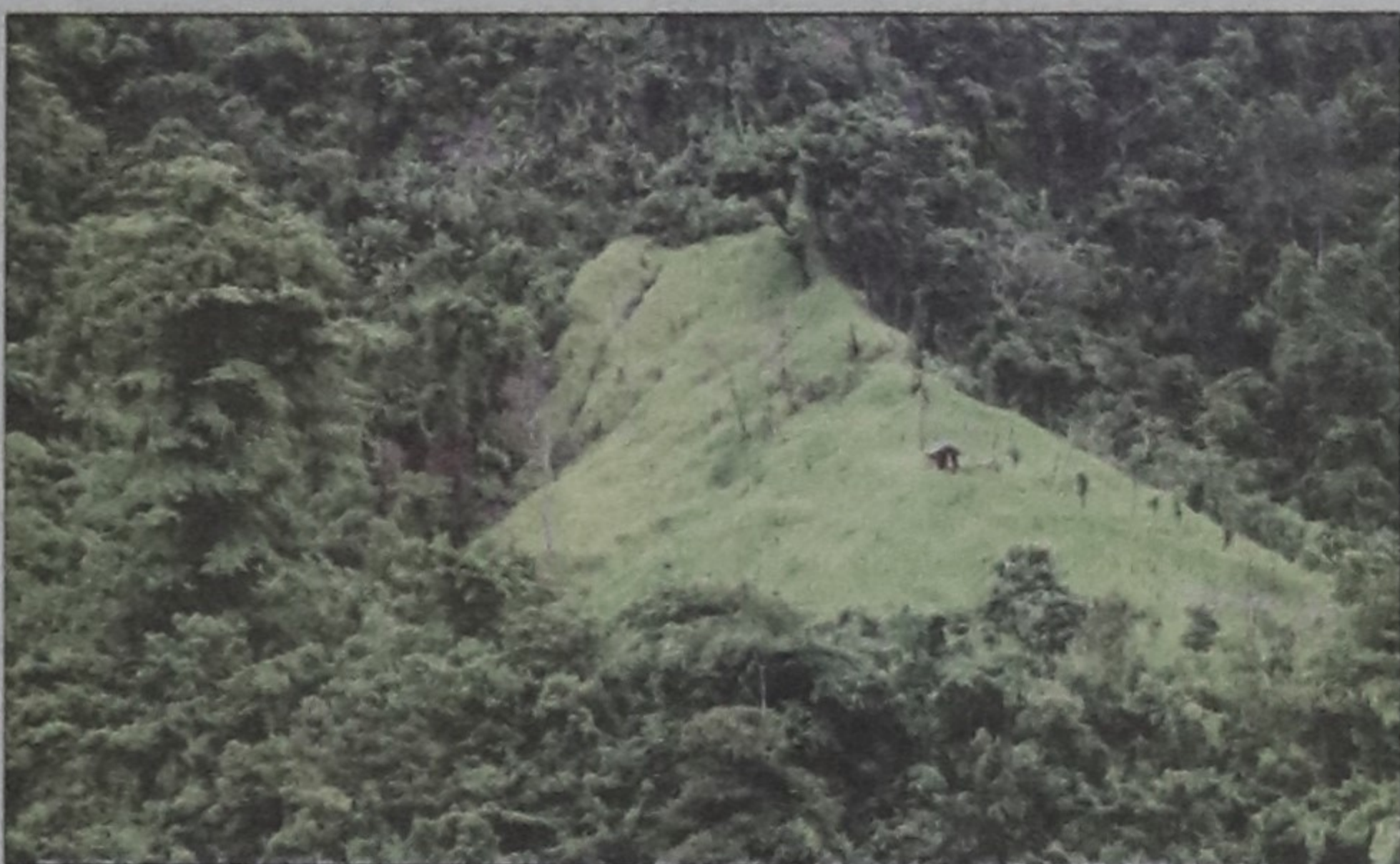
Poamuhuri, Alikadam in Bandarban.