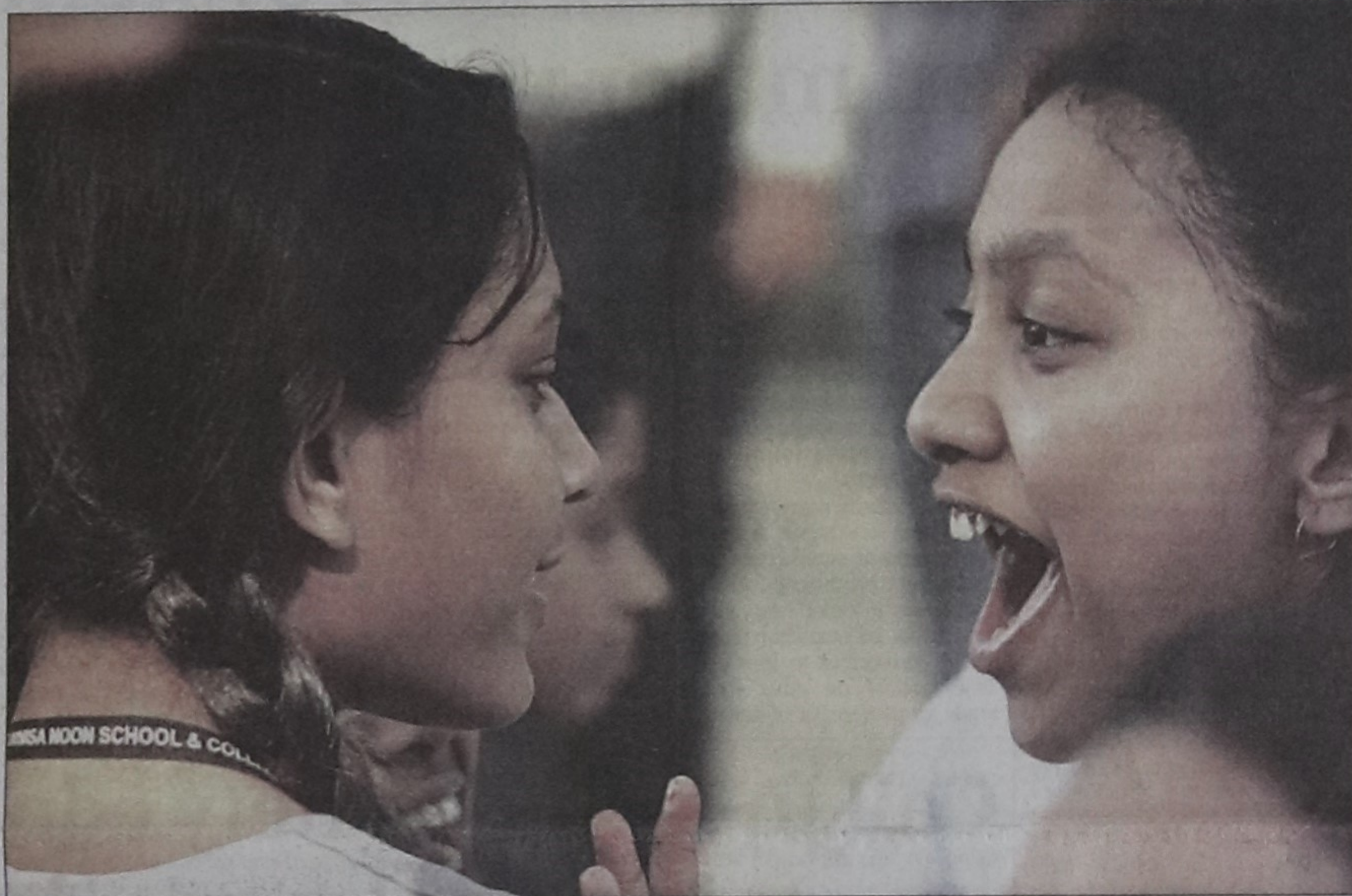
Smiling faces of the girls say it all—hope and aspiration for the future—as jubilant students of Viqarunnisa Noon School in the city yesterday celebrate their success in the primary education terminal examination.