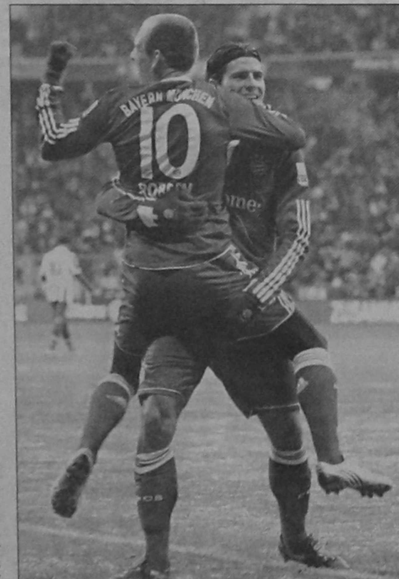
Bayern Munich forward Arjen Robben (L) celebrates his goal with teammate Mario Gomez during their Bundesliga clash against Hertha Berlin at Allianz Arena on Saturday. Bayern won 5-2.

But Berlin are still relegation candidates as they finish the first half of the season with just six points and are six points adrift at the foot of the table.