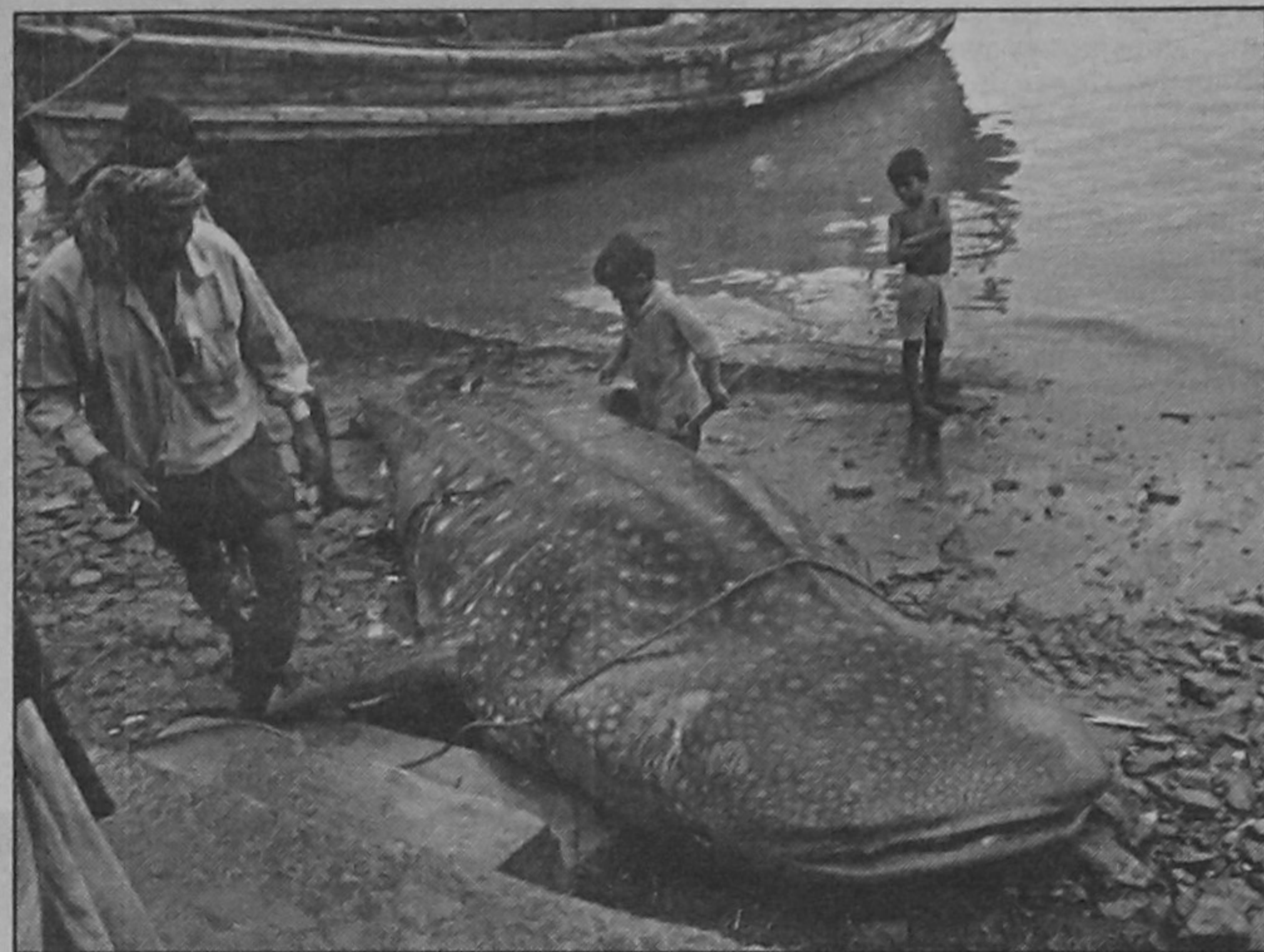
This whale shark, netted from the Bay 100 kilometres off the shore, was brought to Nuniachhata Fisheryghat in Cox's Bazar yesterday.