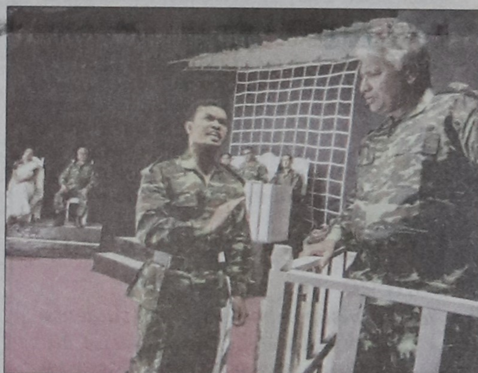
Bodhon Theatre from Kushtia stage the play.

The play attracted a huge turnout of enthusiastic visitors.