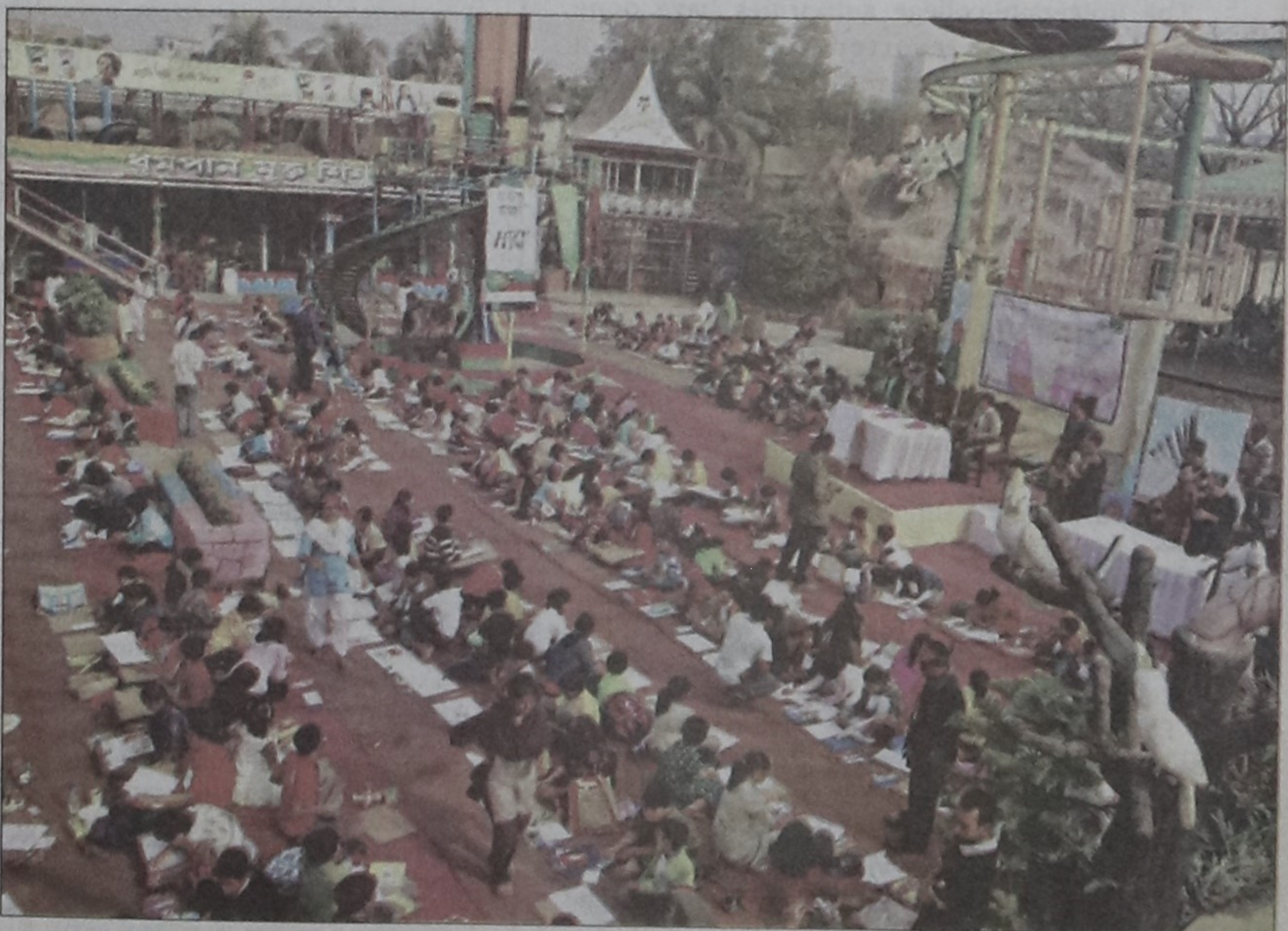
The competition was held to inculcate patriotism in the children.

Apart from the competition, a photography exhibition on the Liberation War was also held.