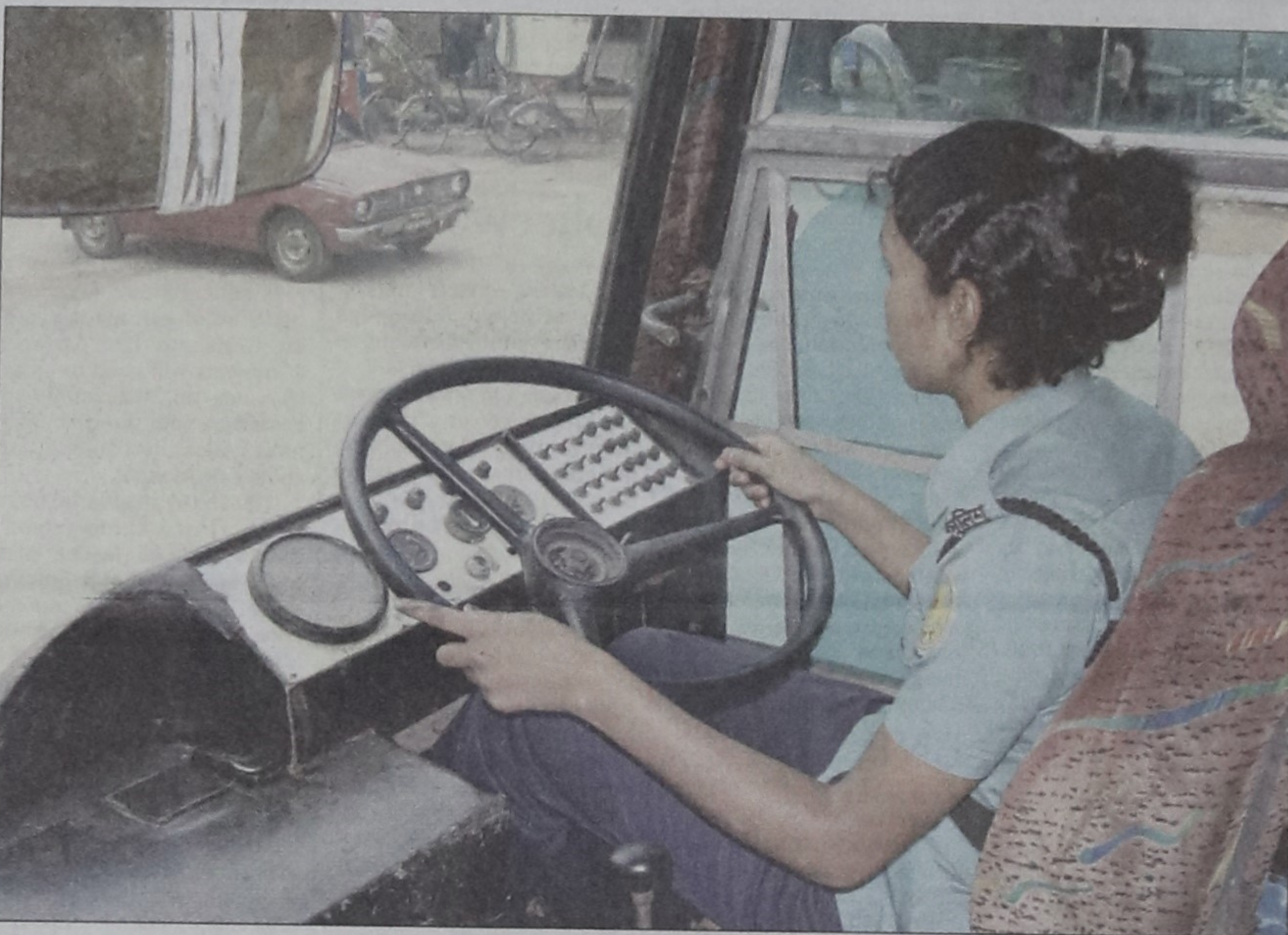
This recent photo shows a policewoman learning to drive a bus at the BRTC training centre in Narayanganj.