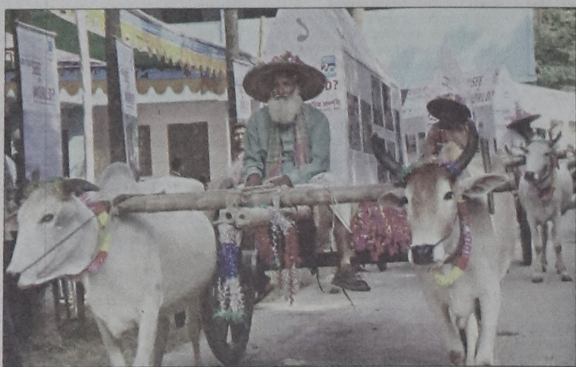
A bullock cart-based mobile photo exhibition was held at Chapainawabganj.