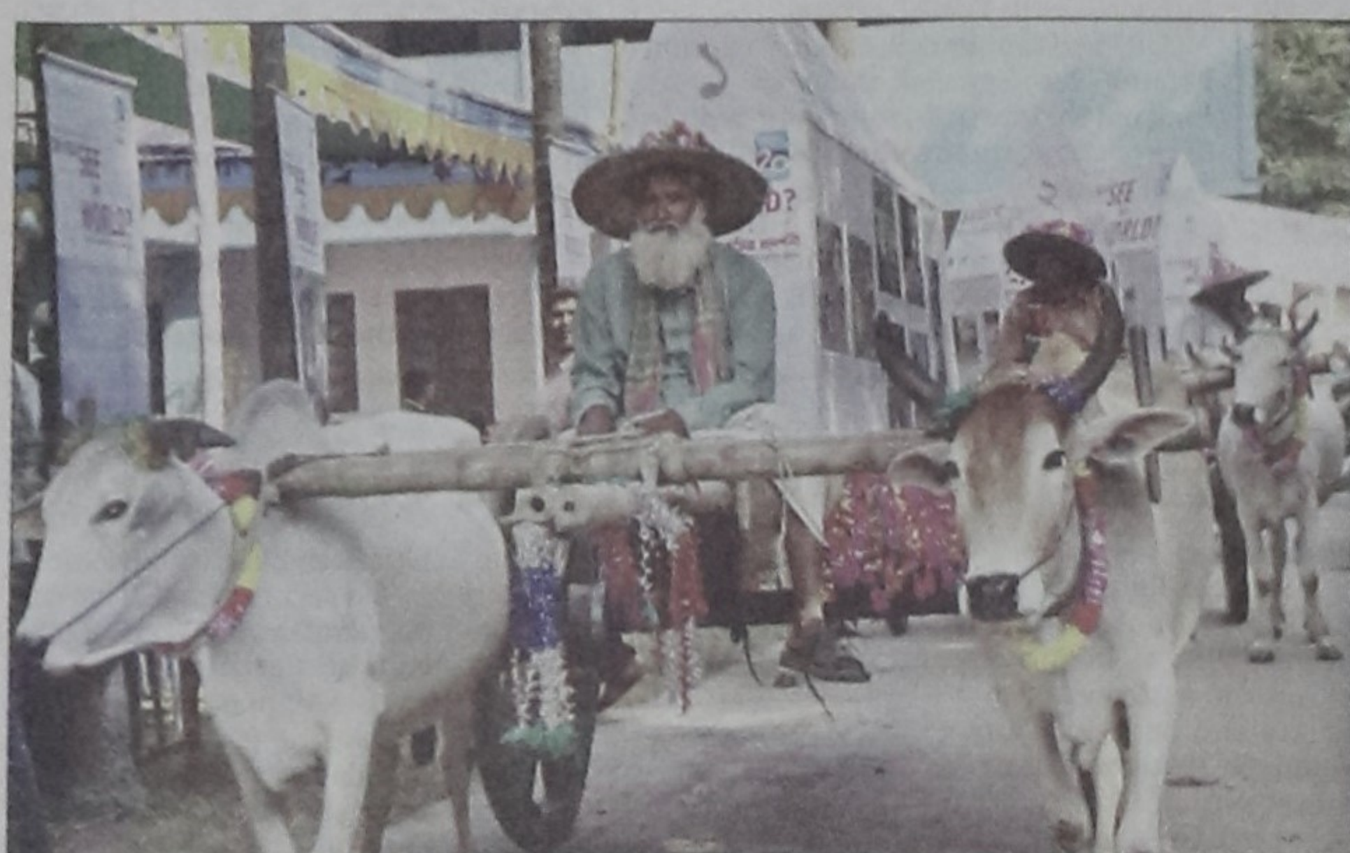
A bullock cart-based mobile photo exhibition was held at Chapainawabganj.