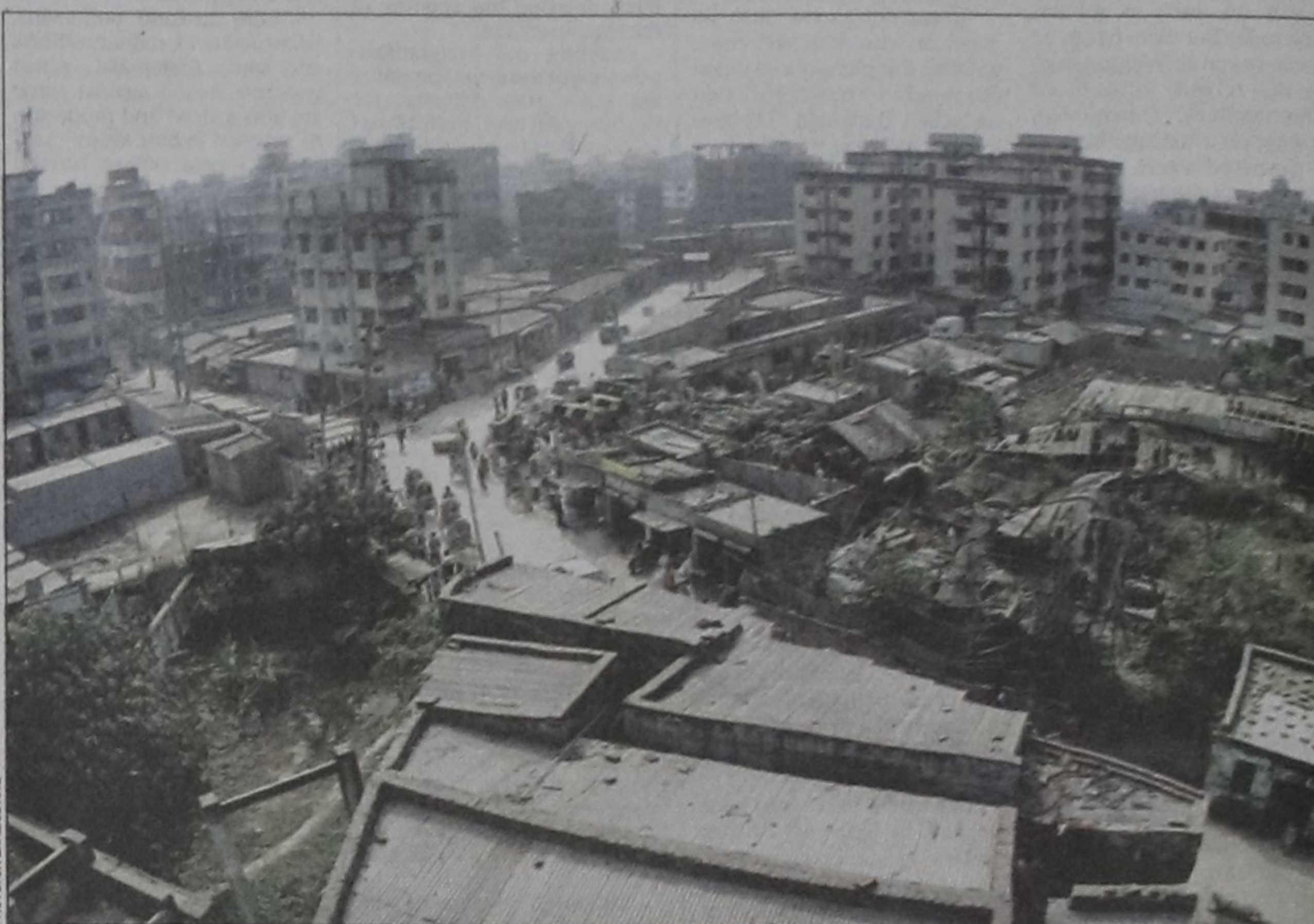
The photo, taken from Bashbari of Mohammadpur, shows the narrow lane that leads to the Third Buriganga Bridge in Basila in Dhaka. As the road gets congested at any time of the day, with the inauguration of the bridge the area would become almost inaccessible.