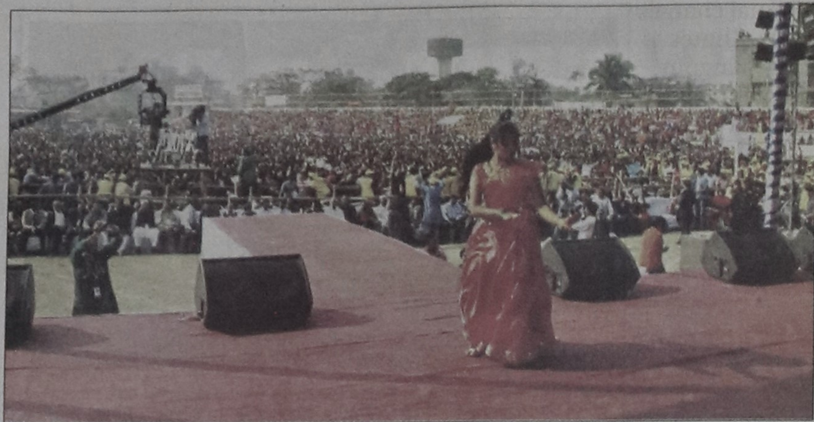
A garment worker performs a dance number at the 2nd Workers' Festival at Osmani Pouro Stadium in Narayanganj yesterday. Bangladesh Knitwear Manufacturers and Exporters Association organised the daylong event. (Story on Page 2)