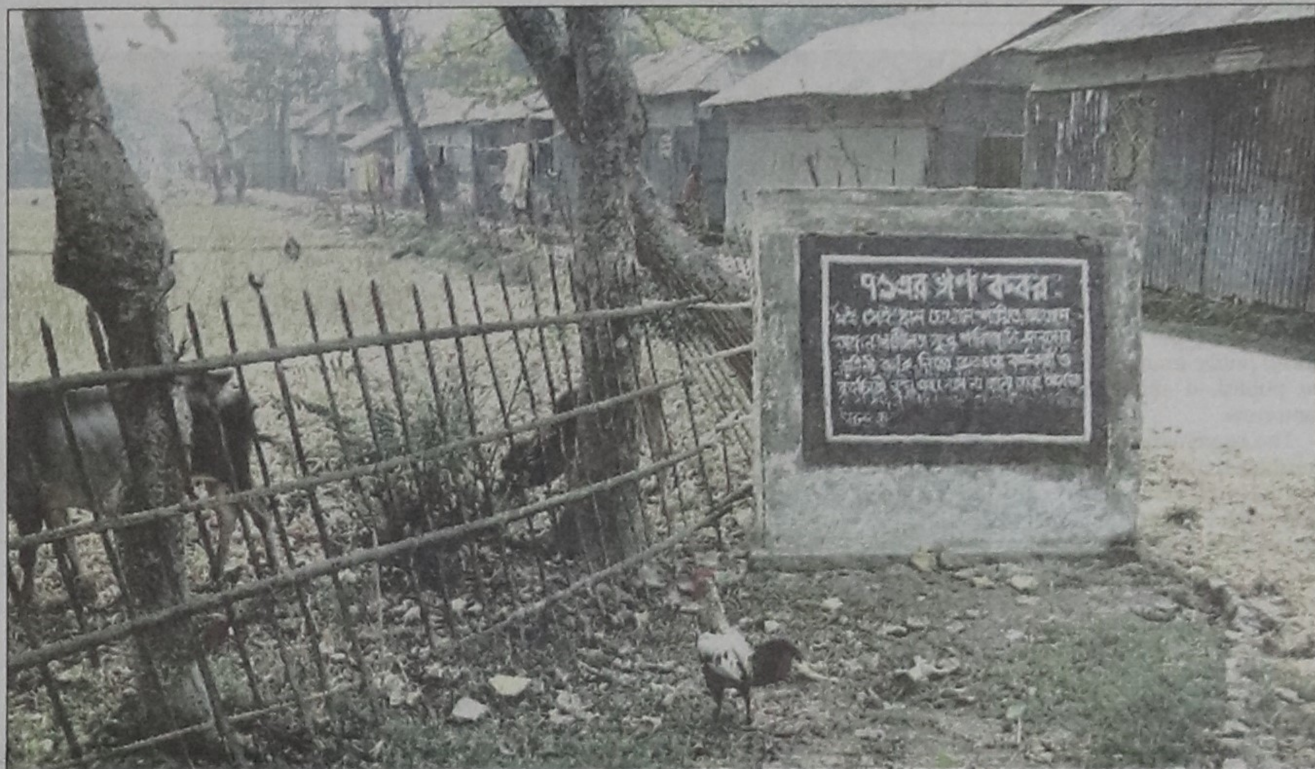
Like hundreds of other mass graveyards in Lalmonirhat district, the Store Para mass grave remains out of the limelight, silently testifying to the genocides that took place in the area in 1971.