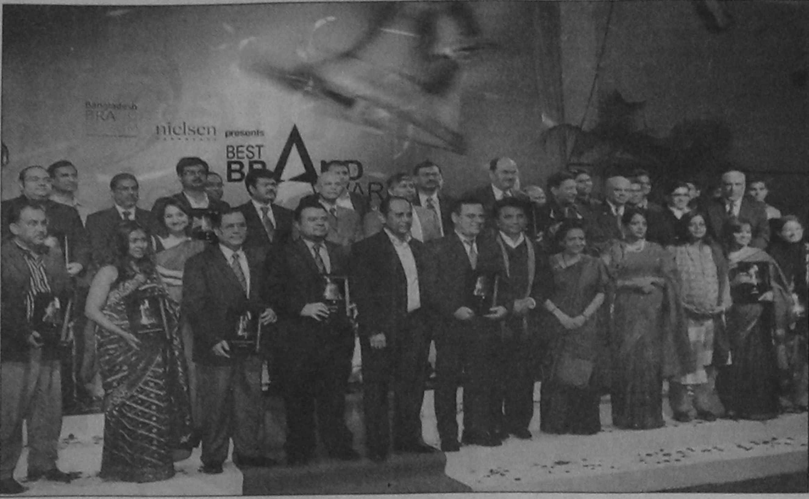
Recipients of Best Brand Award 2009 pose for photographs with organisers and guests at a ceremony organised by Bangladesh Brand Forum and Nielsen at Dhaka Sheraton Hotel yesterday.

In a statement, BBF said it is keen to aid Bangladesh's corporate world in creating world-class brands.