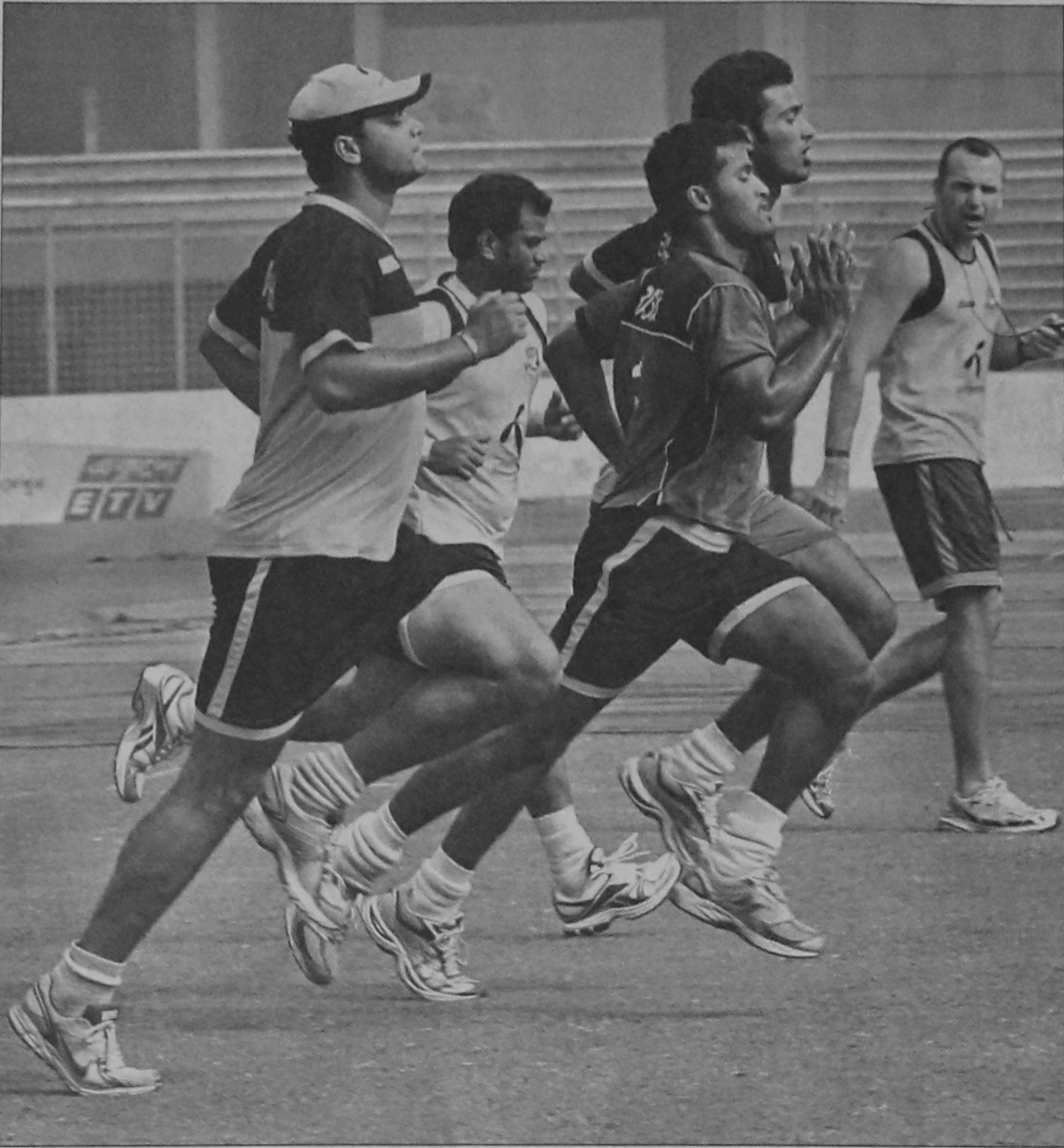
DESPERATE TO BE BACK: Bangladesh captain Mashrafe Bin Mortaza (L) sprints with other members of the national team during a practice session at the Sher-e-Bangla National Stadium yesterday. Out of the national team for the last five months due to knee injury, Mashrafe is trying hard to pass a fitness test for next month's tri-series against India and Sri Lanka.