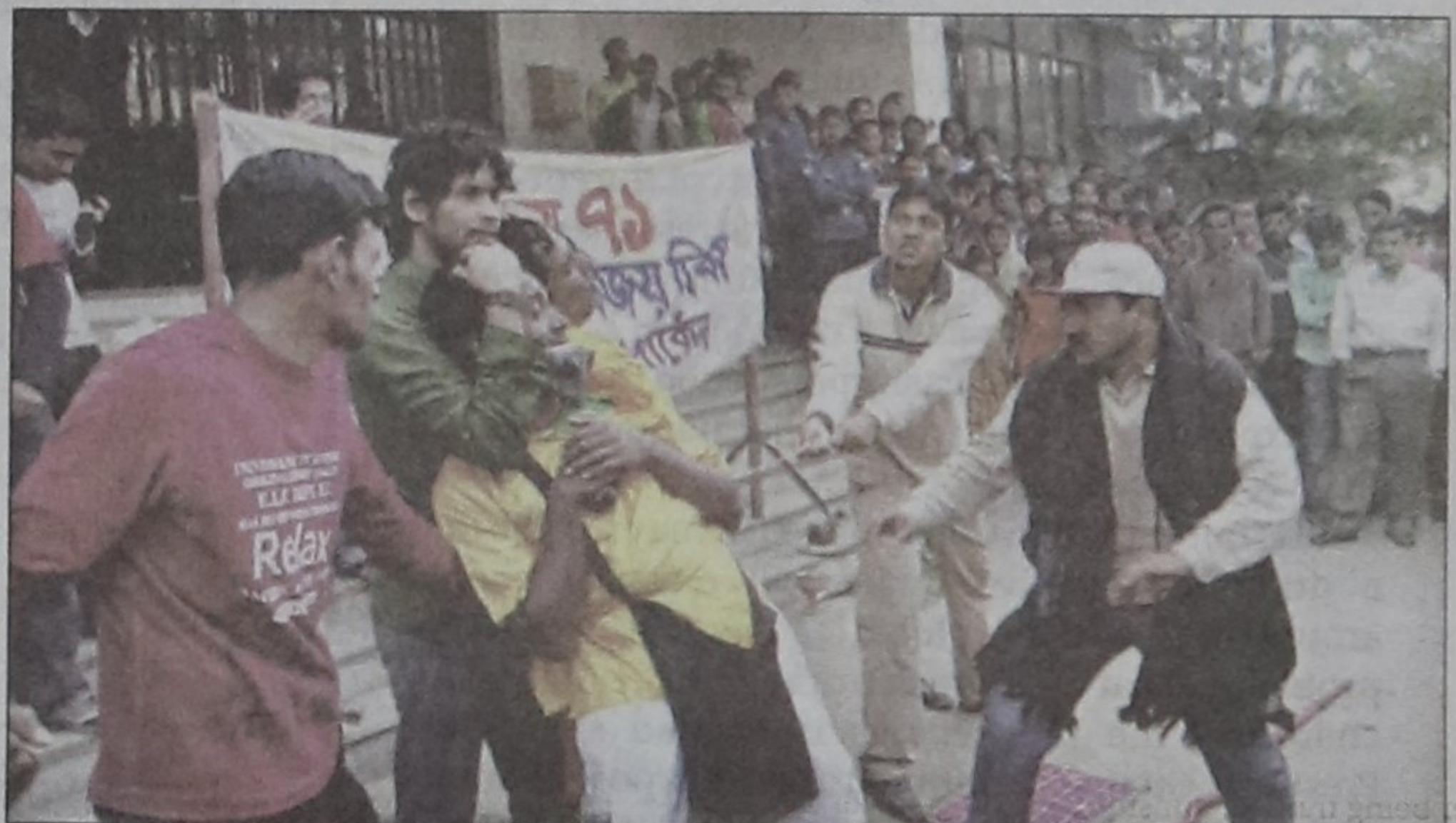
A street performance on Victory Day.