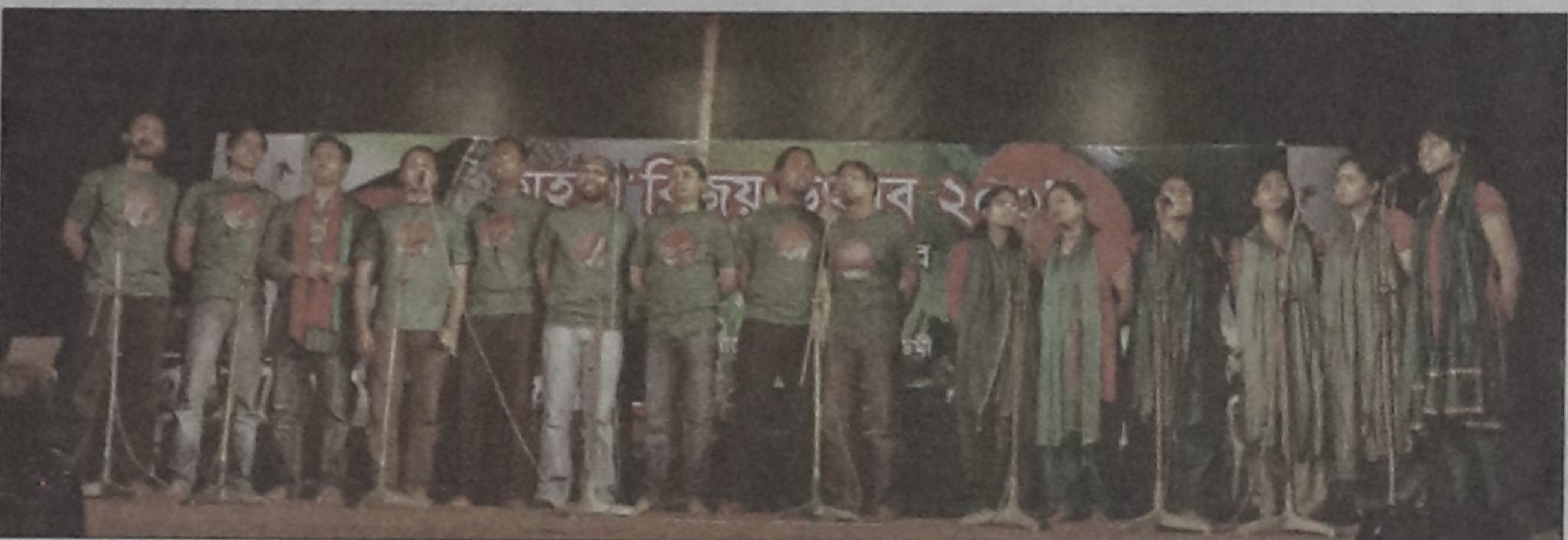
(Top) Honoured SBBK artistes, in the back row, with dignitaries. Group rendition at the programme.