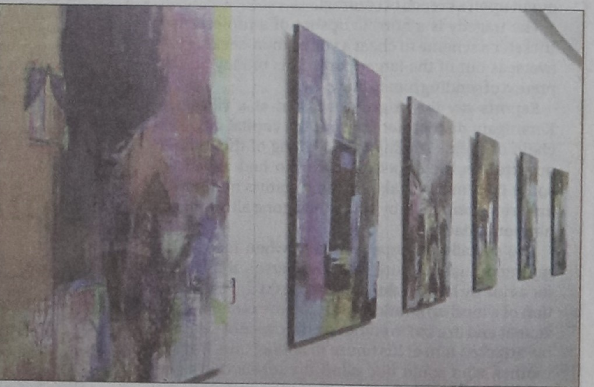
Zahura's solo exhibition is on at Radius Centre, Bay's Galleria.

The exhibition will continue till December 24.