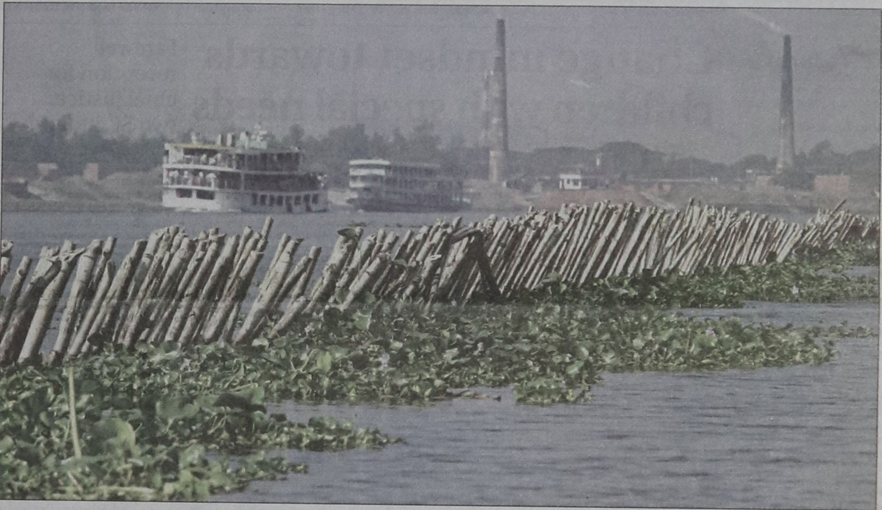
Encroachers fence off a section of the Buriganga near Dikr Char in Narayanganj to set up a brickfield. The Daily Star ran a news item on the same on May 31 this year but the authorities are yet to take any action against the grabbers.

Bangladesh Inland Water Transport Authority (BIWTA) on December 15 declared the four rivers and its foreshores, adjacent to the capital, ecologically critical to save the rivers from encroachers and pollution. They banned dumping sewage from home, industries and other institutions, setting up industries which pollute soil, water, air and sound and any work which can change the natural character of rivers Buriganga, Turag, Shitalakhya and Balu. They also banned activities and hunting that destroy habitation of fish and other aquatic animals. According to the Port Act 1908 and Port Rules 1966, setting up any unapproved structures, digging soil or sand, filling through soil and sand or waste are punishable offences. To keep up the navigability of the rivers and to keep the rivers and its foreshores free from encroachers, BIWTA requested everyone to refrain from setting up illegal structures and lifting sands on the bank of the four rivers. BIWTA also warned the persons who set up illegal structures there and asked them to shift the structures immediately, otherwise they will take action. According to survey report by Dhaka, Narayanganj, Gazipur and Munshiganj district administration, over 8000 land grabbers occupied areas of the four rivers building various structures.