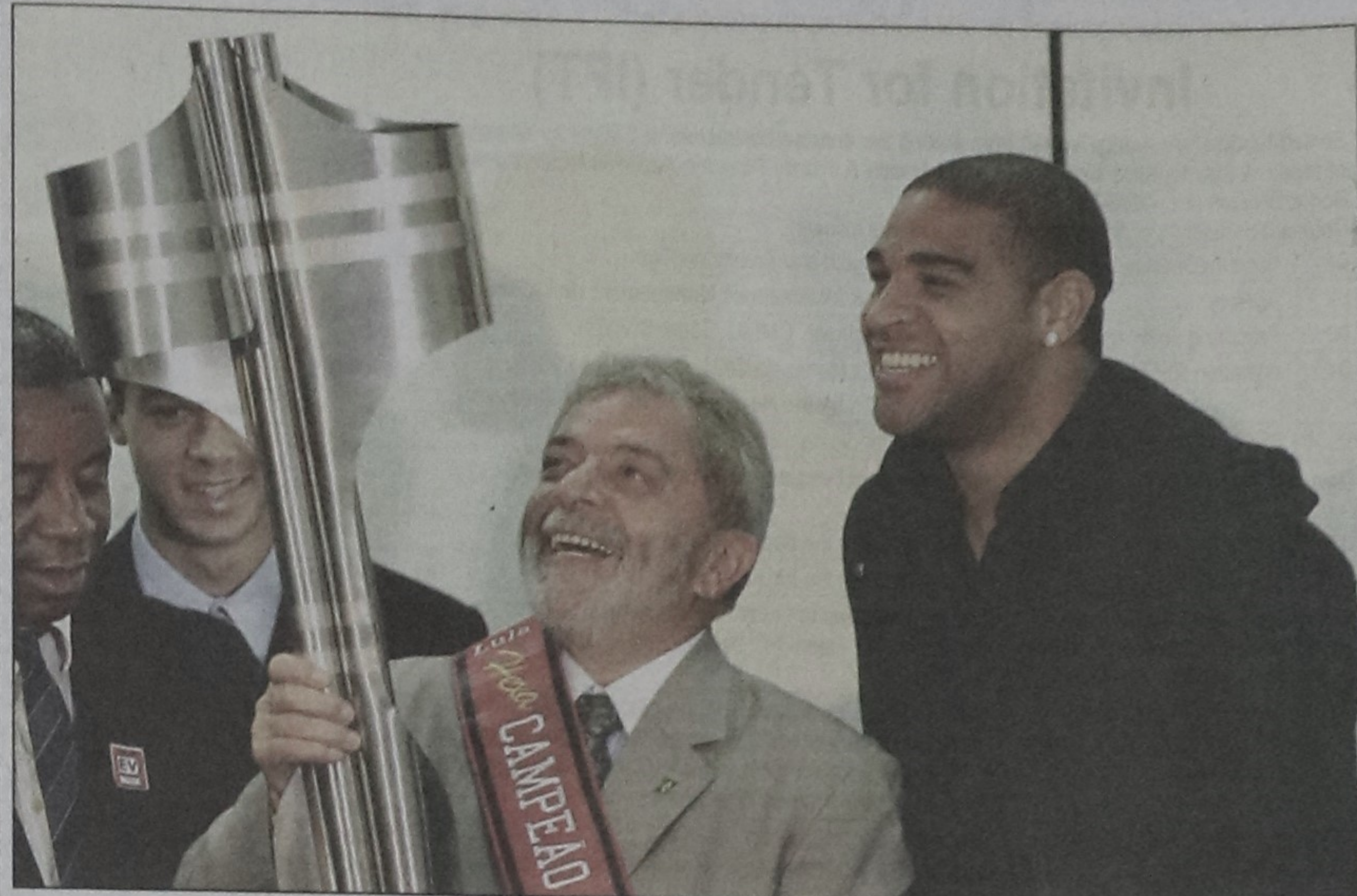
Brazil president Luiz Inacio Lula da Silva (C) holds the Brazilian football championship 2009 trophy obtained by Flamengo next to club striker Adriano (R) during a ceremony in Brasilia on Monday.

"The challenge is bigger here because there are so many problems. Everybody said to me when I was offered it not to take the job, but for me it made me even more ambitious to take it."