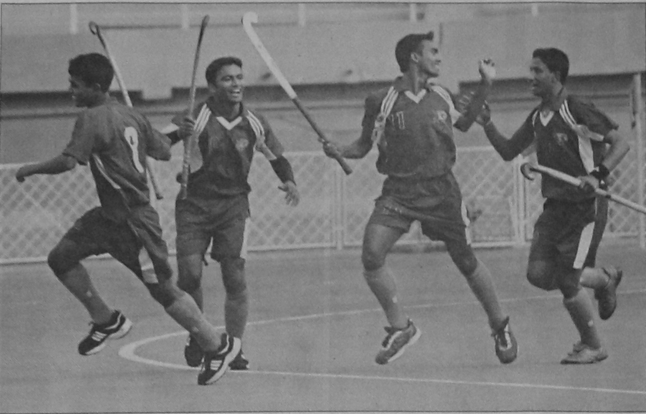
BKSP players celebrate a goal in their 3-1 win against Bangladesh Air Force during a Victory Day Hockey competition clash at the Maulana Bhasani National Stadium yesterday.