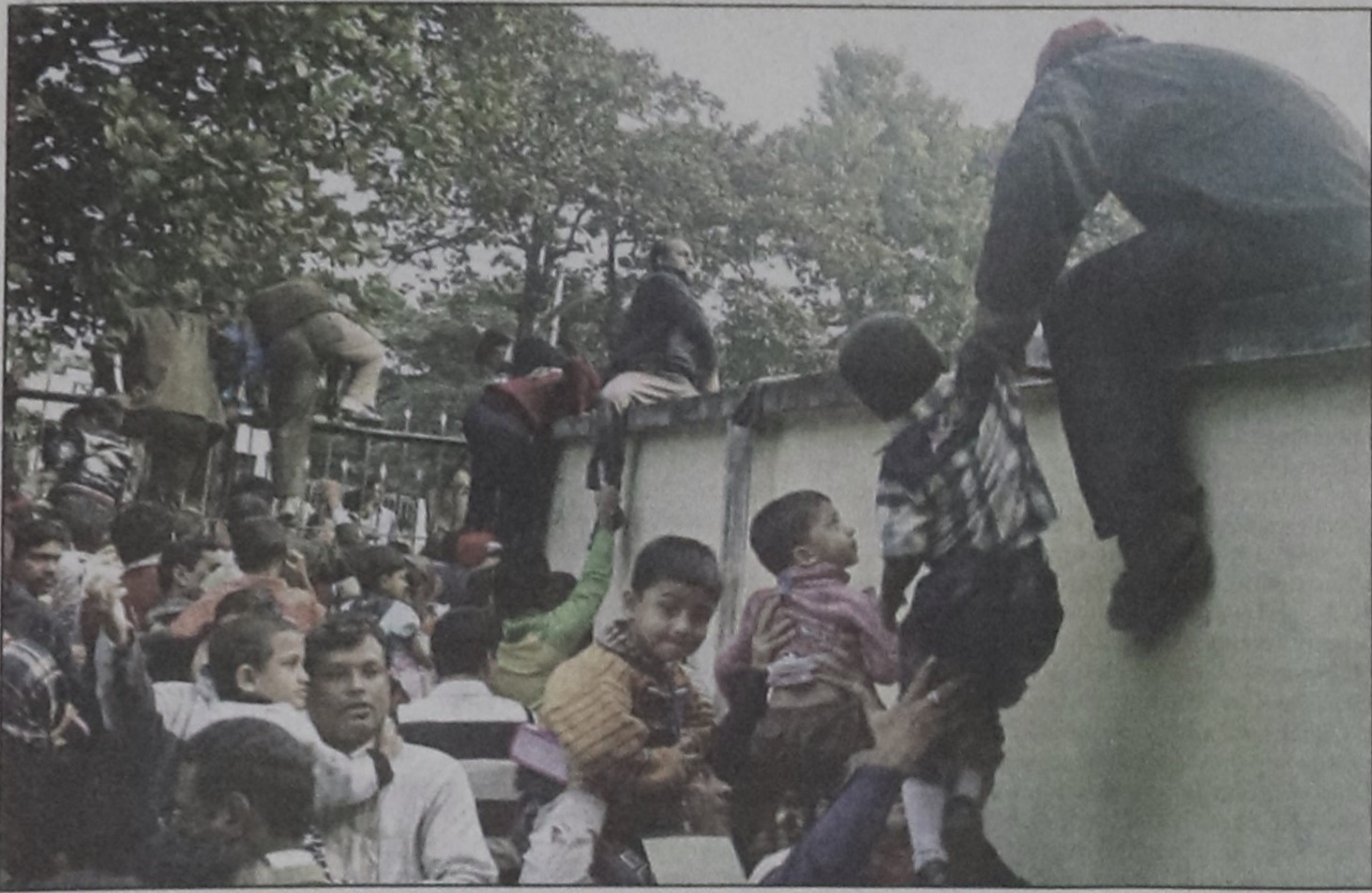
FIRST STAGE OF ADMISSION BATTLE: Several guardians make frantic attempts to reach their kids to the seat for test of admission into the nursery class of St Mary's School in Chittagong yesterday.