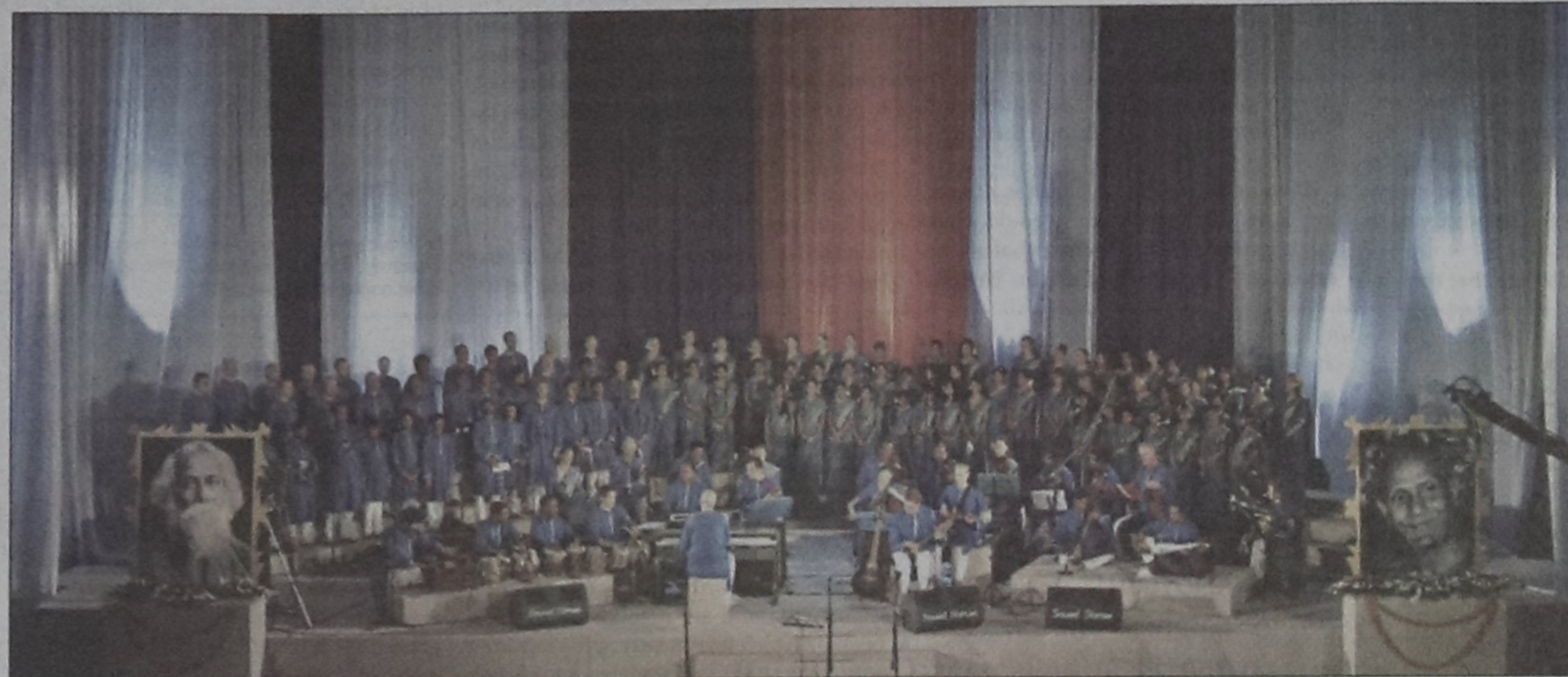
Artists of Shurer Dhara and Gandharva Loka Orchestra perform songs of Tagore and Sri Chinmoy at the programme.