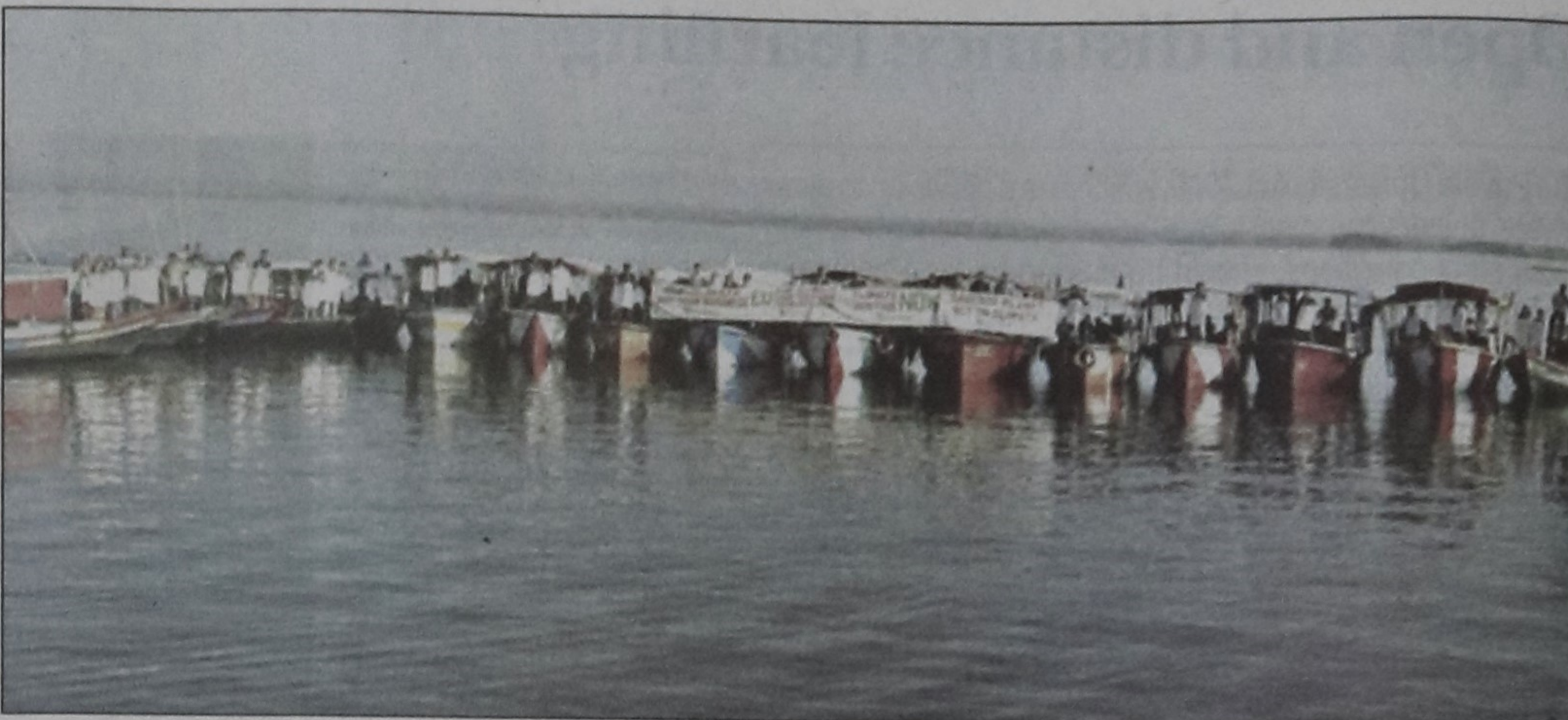
Hundreds of people join a human chain on engine boats on Kaptai Lake near the DC bungalow in Rangamati demanding compensation to the victim countries for the harmful effect of climate change. Global Village and Rangamati Environment Conservation and Development Organisation arranged the human chain yesterday to create awareness about the impact of worldwide climate change, mainly caused by the industrialised countries.

Freedom fighters and locals have arranged Qurankhani, milad mahfil and discussion on Sonamsajid premises today.