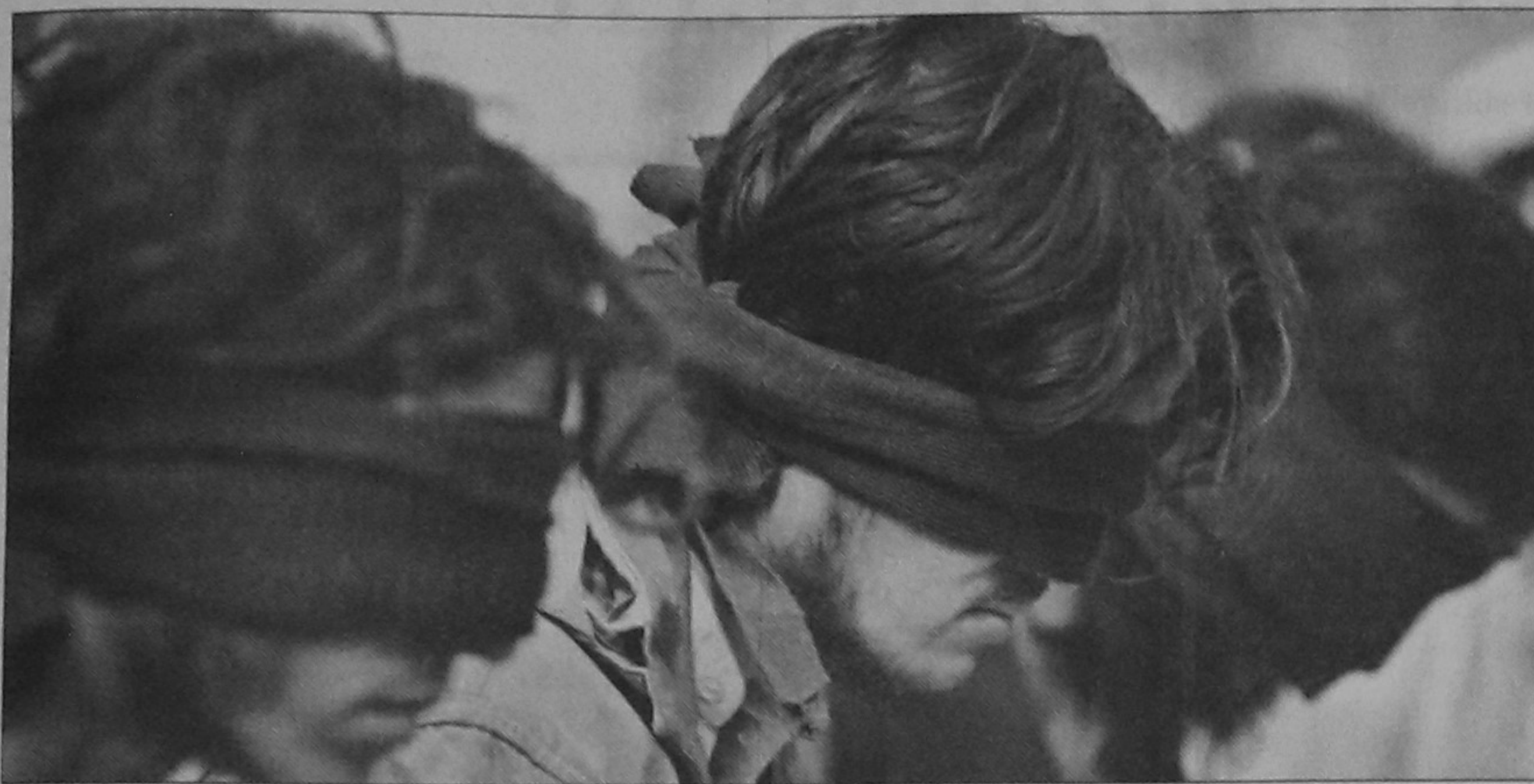
Suspected Pakistani militants were presented at a media briefing in Bara yesterday. A bloody clash with security forces left at least 12 militants dead with 90 arrested as arms and ammunition were discovered during a search operation in the Shalobar area in Bara Tehsil of Khyber Agency. Pakistan's PM Yousuf Raza Gilani said yesterday that the army had driven the Taliban out of South Waziristan and the government is discussing taking the battle to Orakzai tribal region.