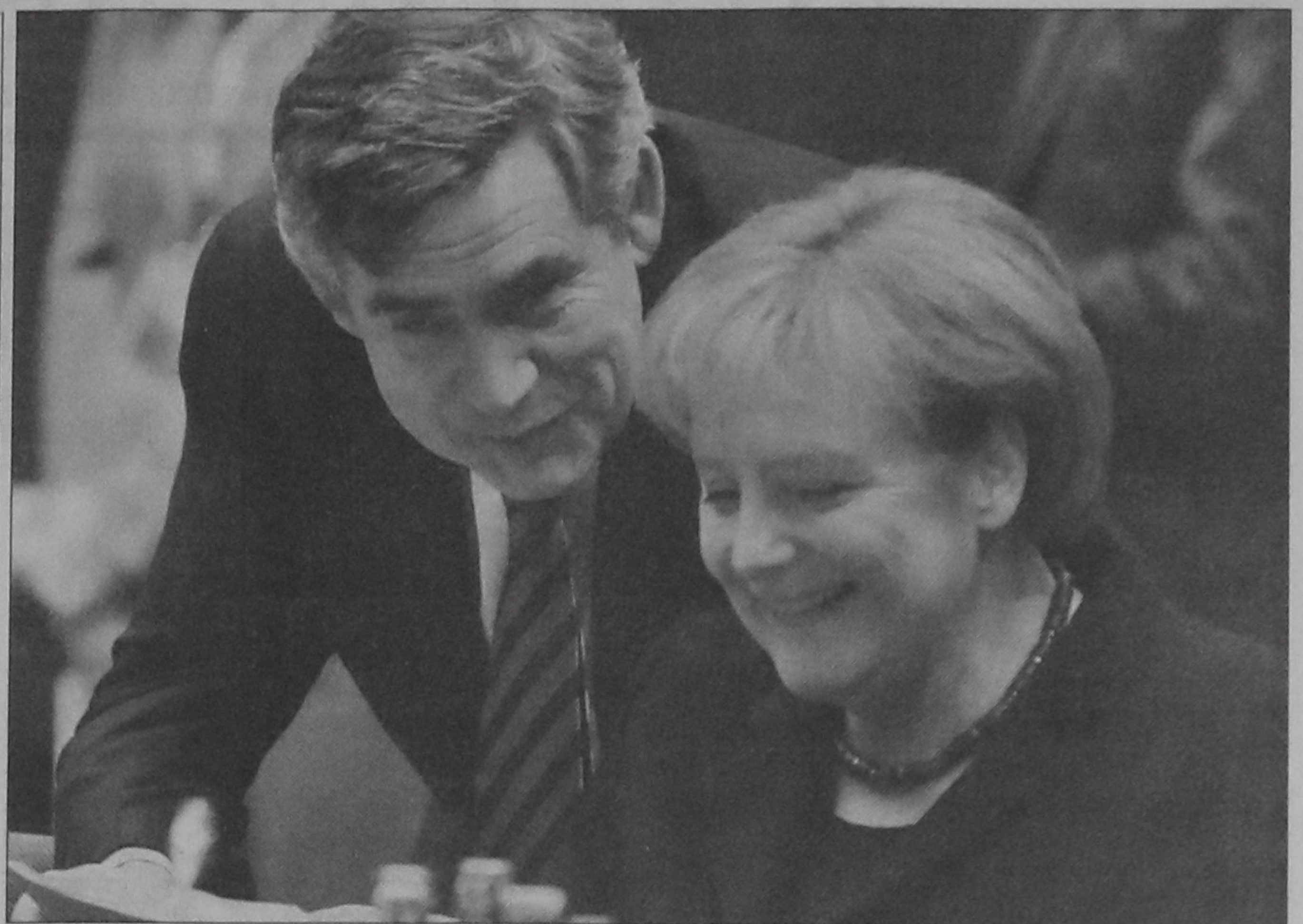
British Prime Minister Gordon Brown (L) talks with German Chancellor Angela Merkel prior to a working session at an EU summit at the European Council headquarters in Brussels yesterday. European Union nations have agreed to give 7.2 billion euros to help developing nations tackle climate change and boost faltering UN climate talks in Copenhagen.

The conviction Tuesday followed Cambodia's decision last month to name Thaksin, a fugitive from justice in Thailand, as its special economic adviser. The appointment and Thaksin's subsequent visit to Cambodia angered the government in Bangkok, and resulted in a recall of ambassadors from both sides.