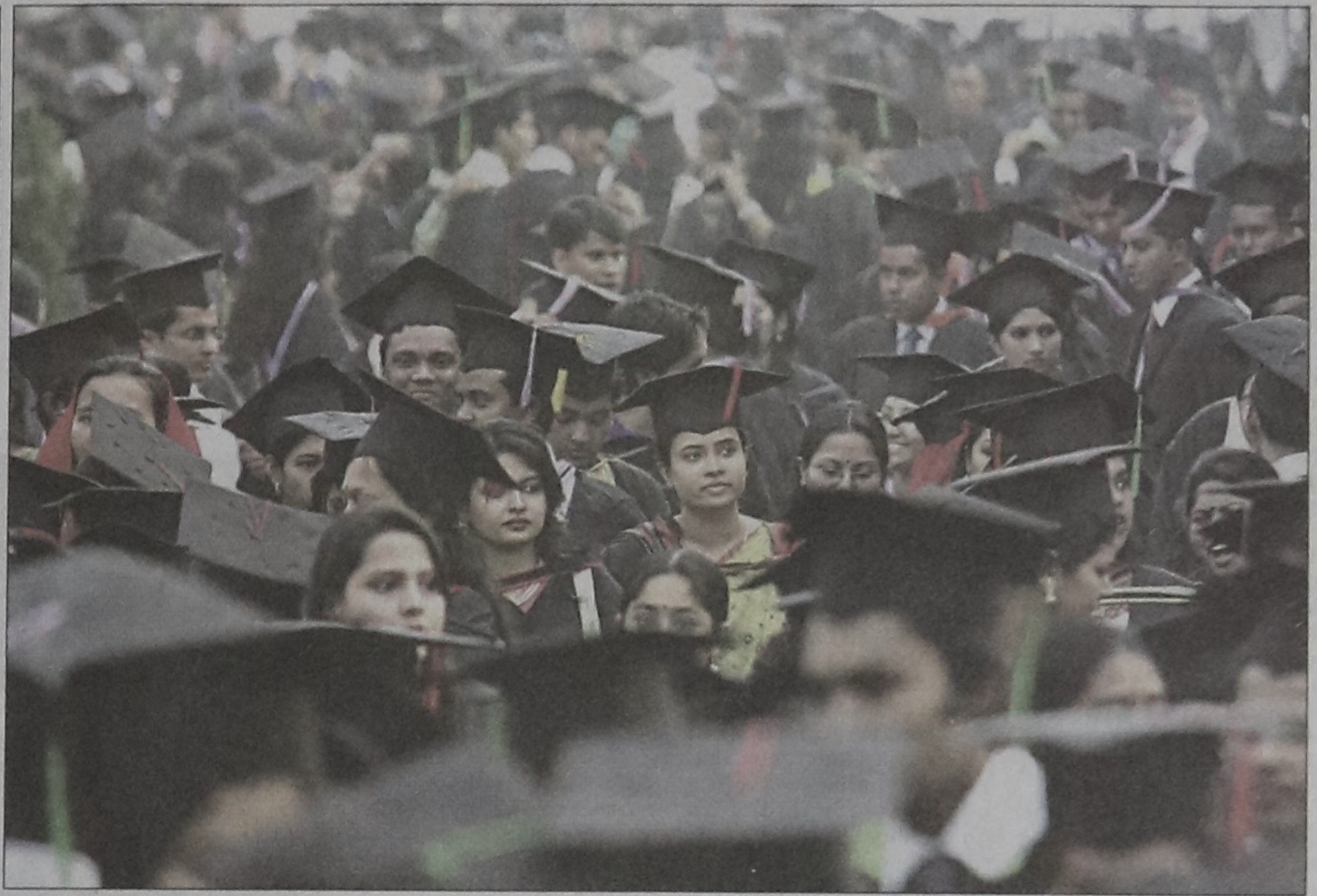
Graduates and gold medallists yesterday at the Dhaka University central playground take part in a dress rehearsal of the university's 45th convocation to be held today. Story on page 16.