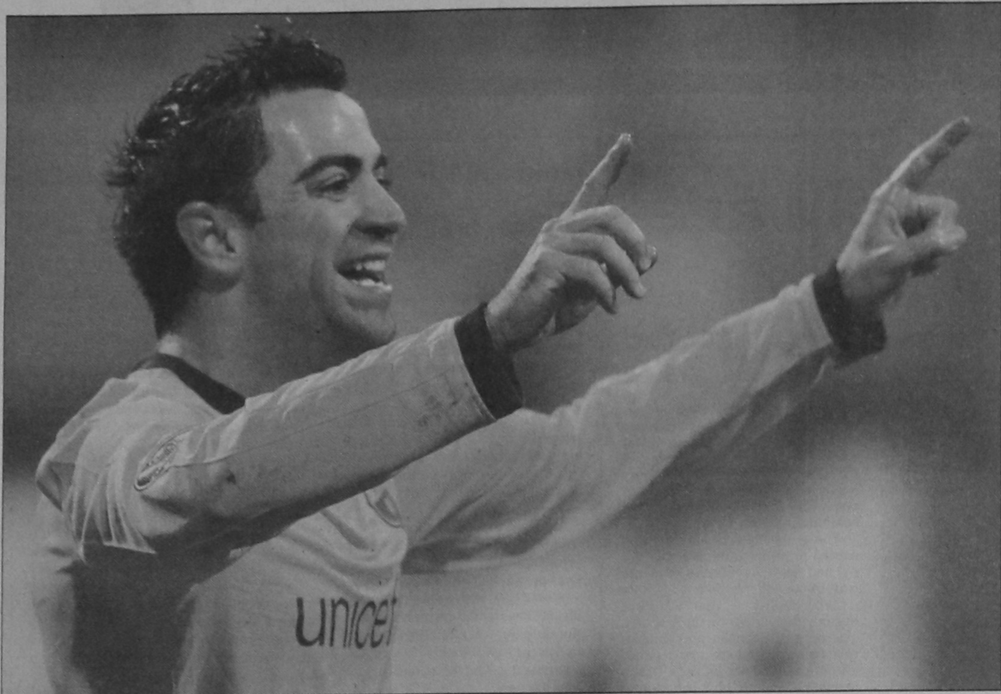
Barcelona midfielder Xavi Hernandez celebrates his equalising goal against Dynamo Kiev during their Champions League encounter in Kiev on Wednesday.