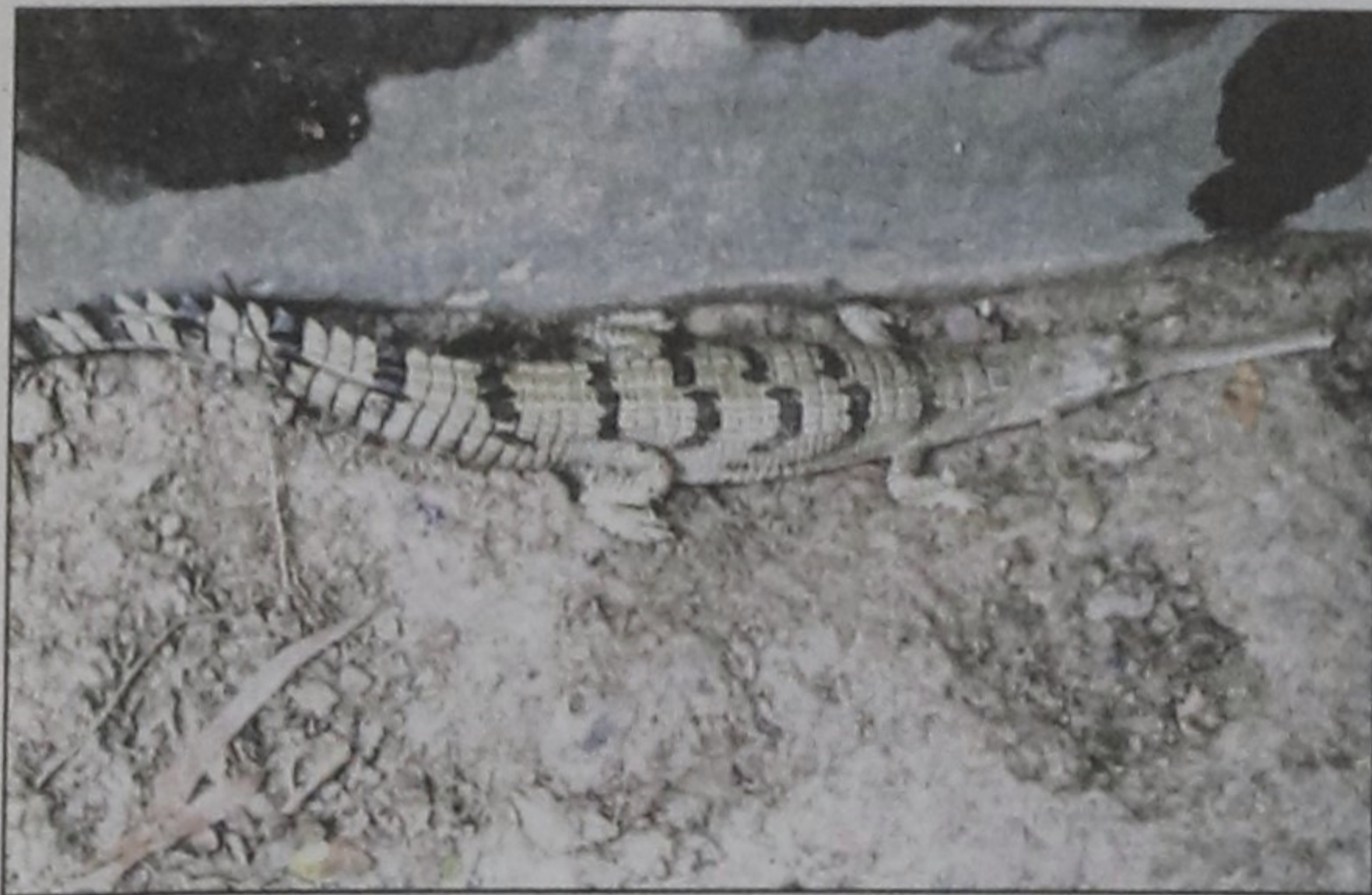
The baby gharial netted from Padma River on Wednesday, and the recently caught fishing cat at Rajshahi Zoo.