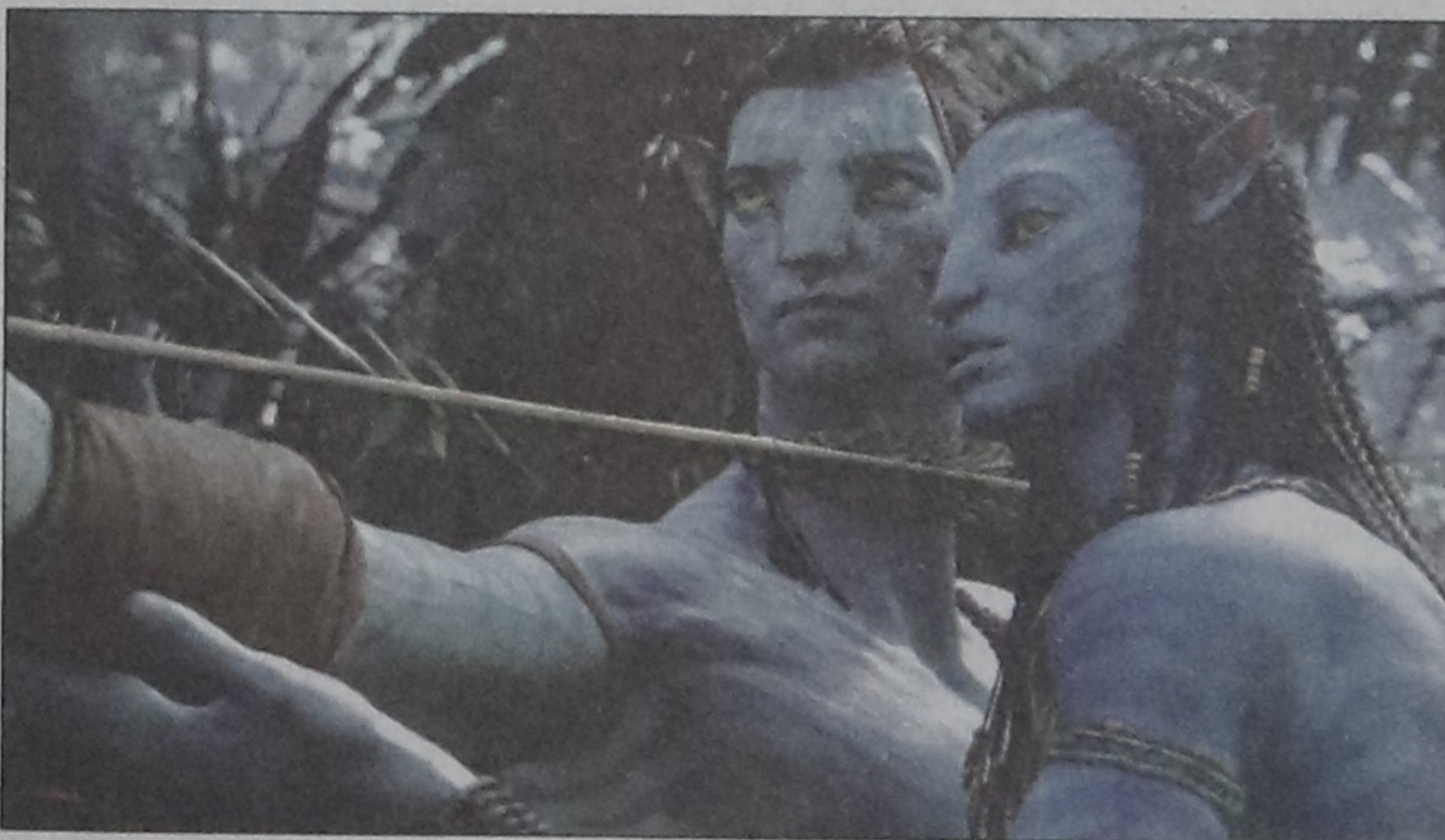
Two avatars from the much-anticipated new sci-fi 3D epic, "Avatar".

These technical improvements allowed Cameron more fluidity in the production process allowing him to "construct the movie in the manner he thought creatively was best," according to Cameron.