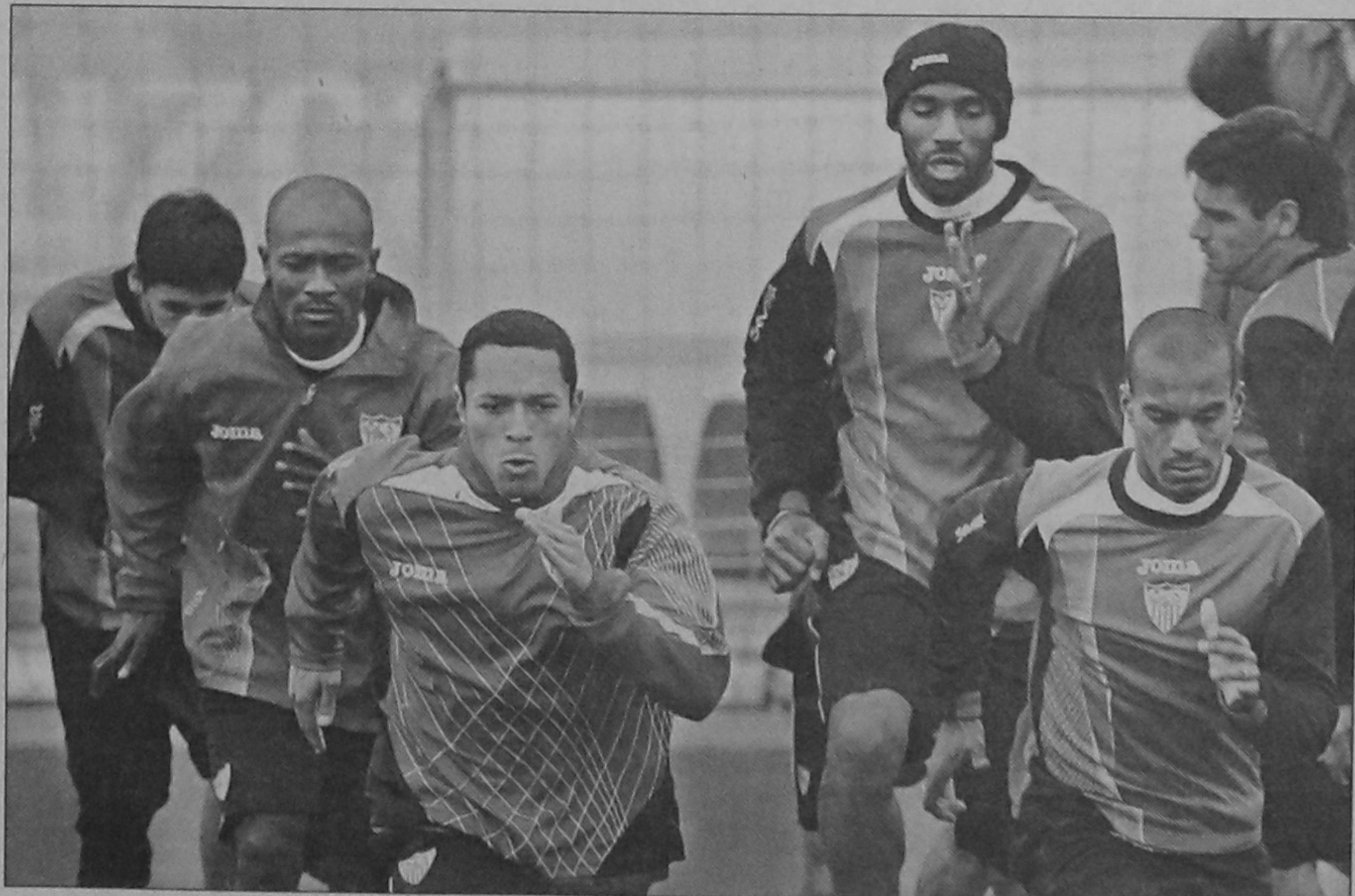
Sevilla players run during a training session in Sevilla on Tuesday on the eve of their Champions League encounter against Glasgow Rangers.

But the Belgian federation said it will ask for financial compensation from Alkmaar.