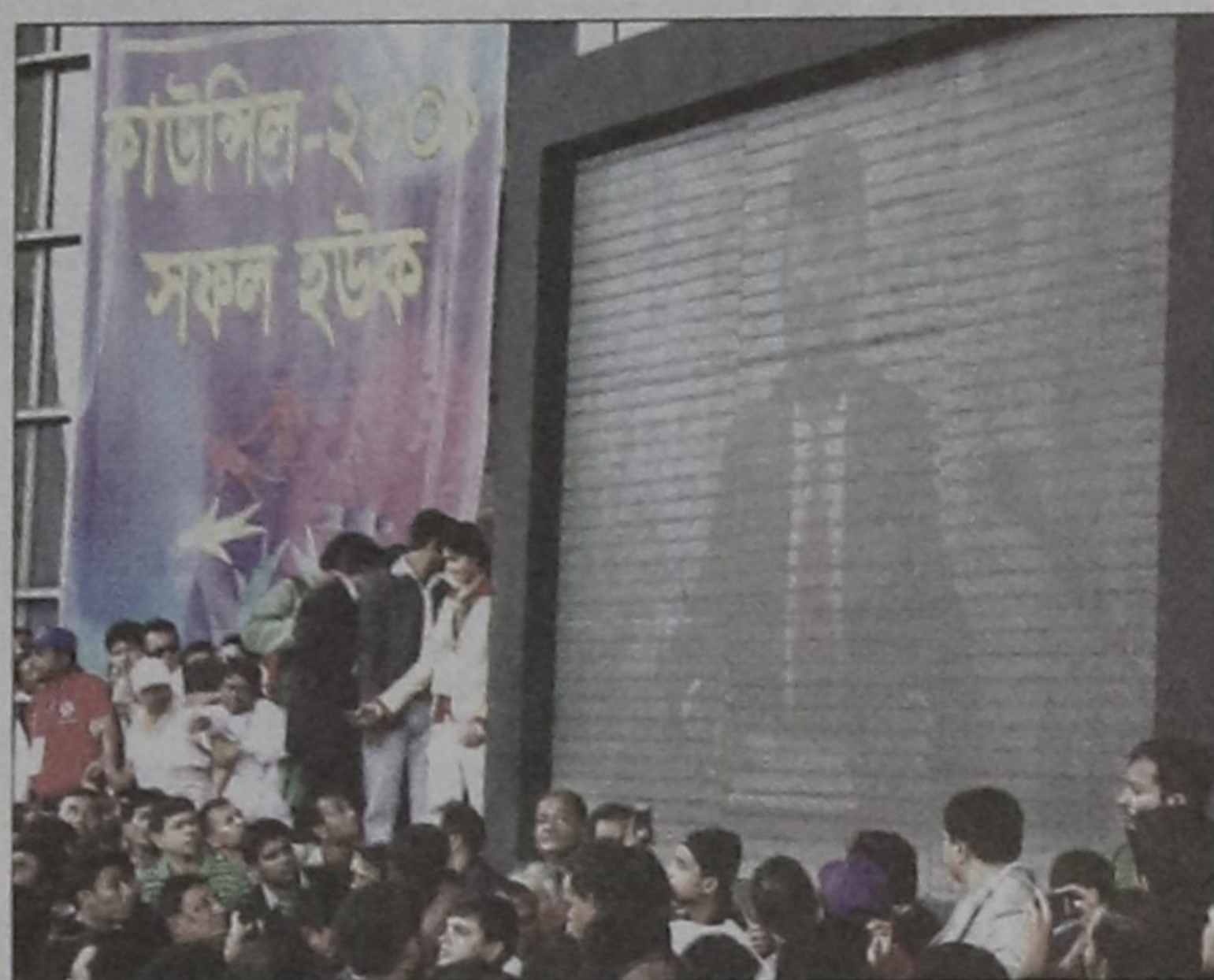
A video speech of Tarique Rahman is being played at yesterday's BNP council.