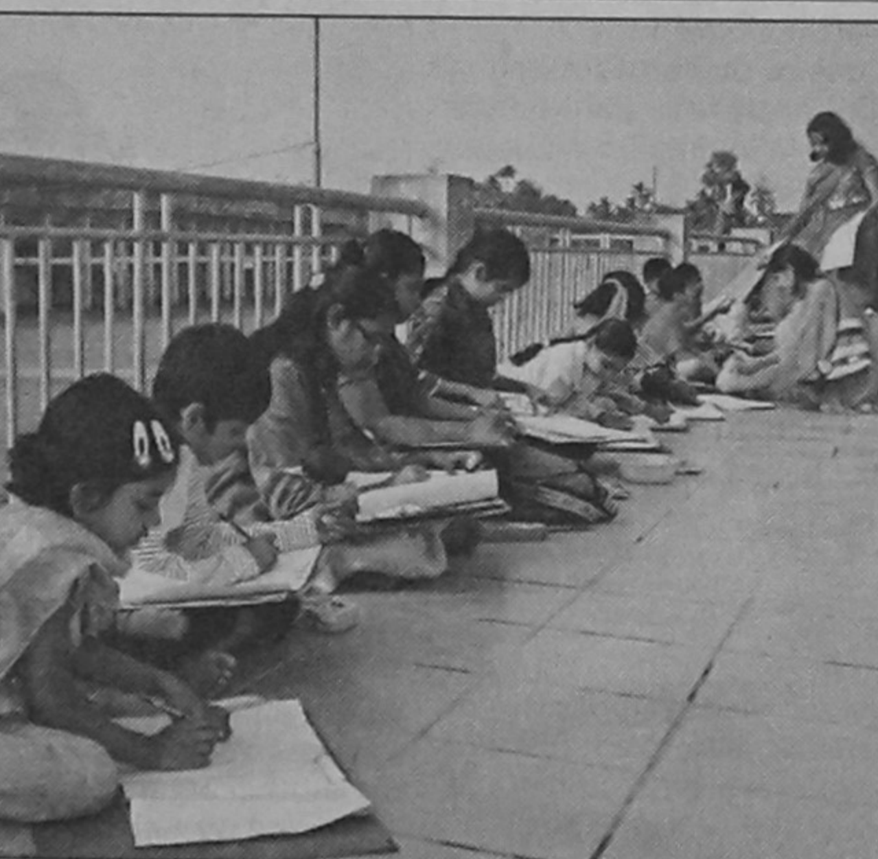
Kanchi Kanchar Mela and Chandpur Swimming Club jointly organise a children's painting contest at Arun Nandi Swimming Pool in Chandpur yesterday, marking the first death anniversary of the world's famous swimmer.

The court asked the authorities concerned to investigate the matter and submit report within December 25.