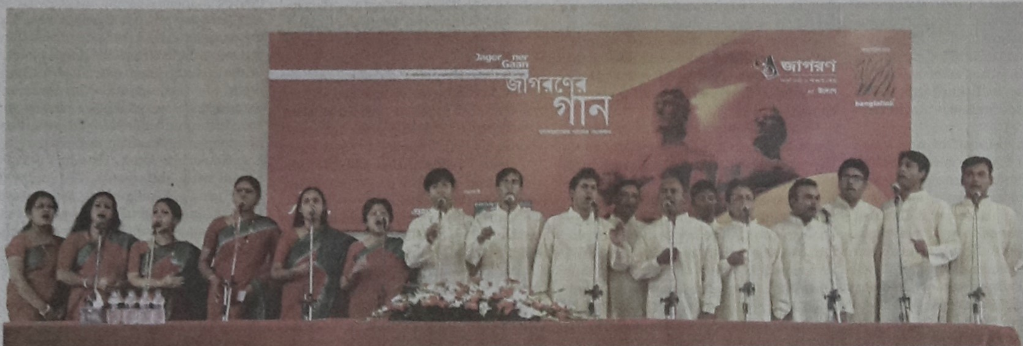
Artists sing patriotic songs at the programme.