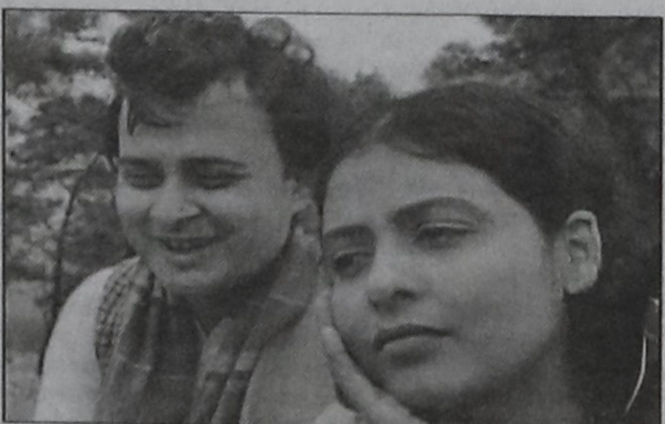
A scene from Ritwik Ghatak's "Meghe Dhaka Tara".

The nomenclature for the online contest was derived from the highly popular limited over format of cricket envisaging 20 overs for each side.