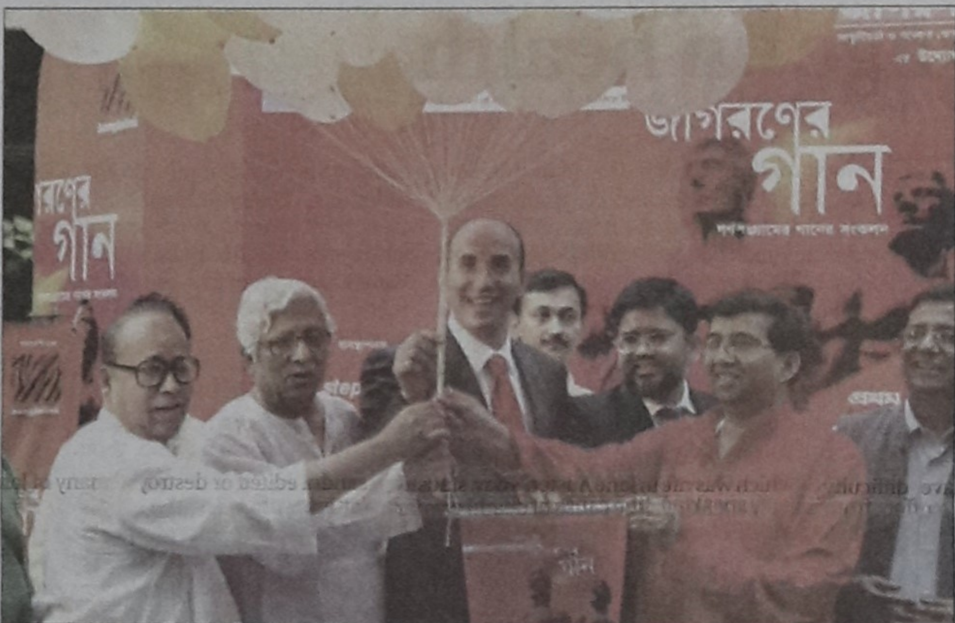
Dignitaries at the album launch.