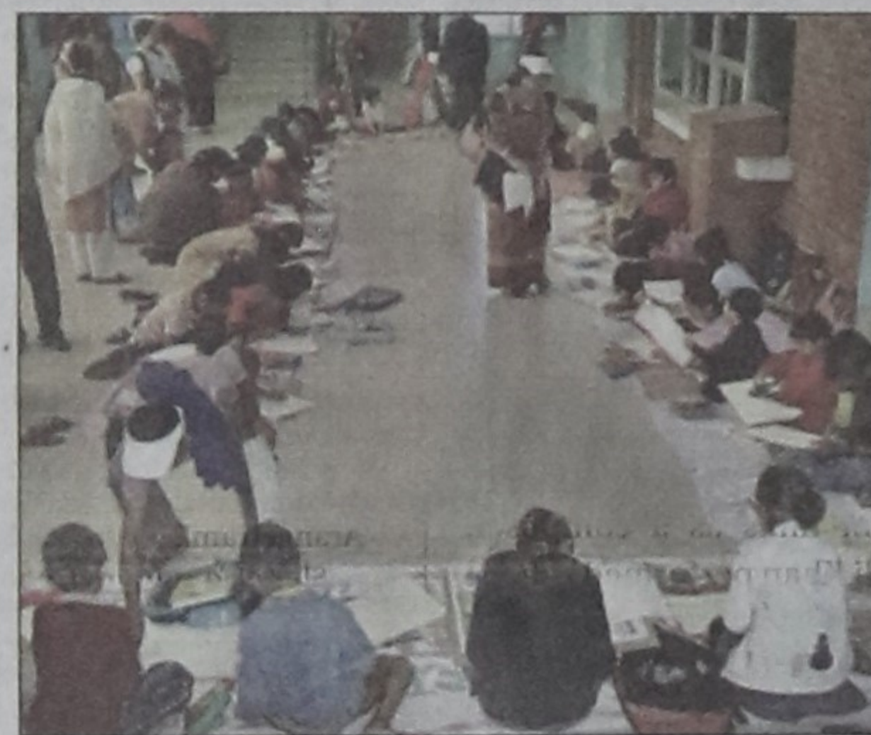
Young participants at the competition.

Before the competition, in a rally organised by the same organisation, hundreds of people paraded the main roads of hill town Khagrachhari to create awareness about volunteerism in Khagrachhari.