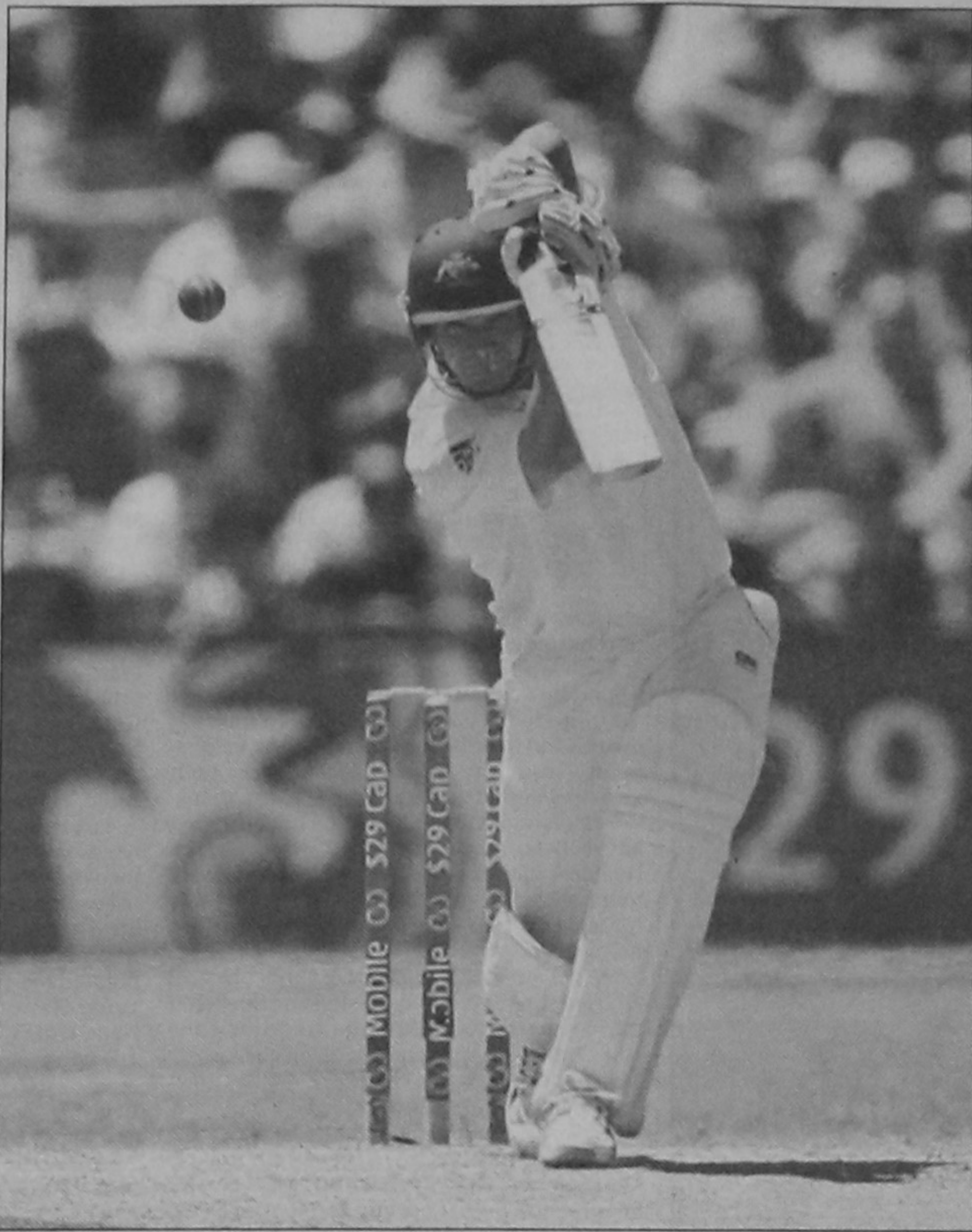
Australia opener Shane Watson drives one straight during his unbeaten knock of 96 on the second day of the Adelaide Test on Saturday.

(England soccer super star) "Football is in our culture, in our DNA, it's in us from the moment we are brought into this world, from when we are born and that's something we will always have."