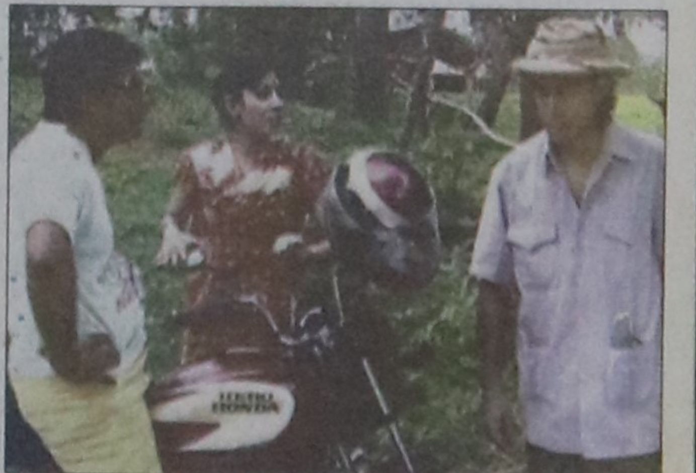
A scene from "Sakin Sarisuri".