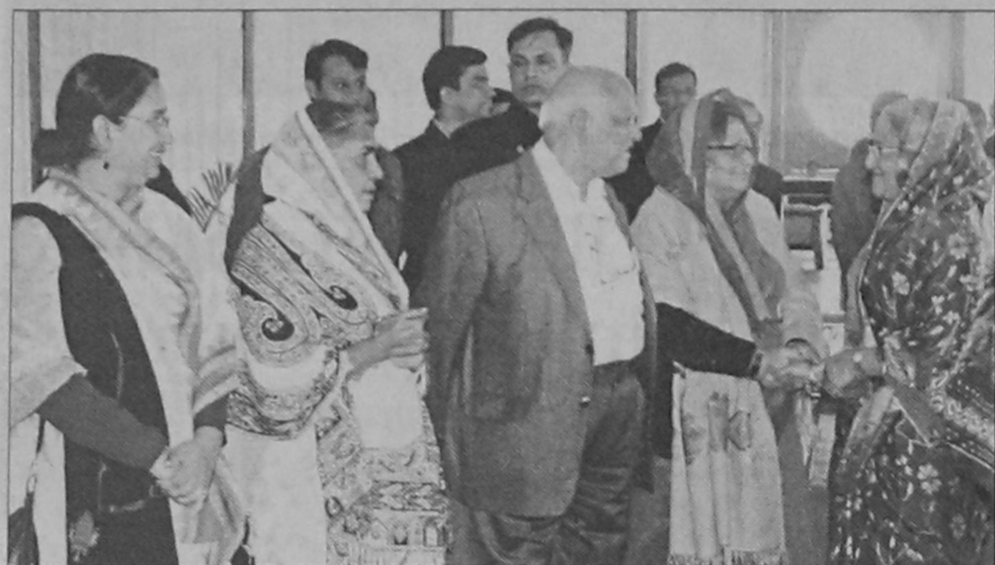
Deputy Leader of the House Syeda Sajeda Chowdhury, Finance Minister AMA Muhith, Agriculture Minister Matia Chowdhury and Foreign Minister Dipu Moni receive Prime Minister Sheikh Hasina yesterday on her arrival at Zia International Airport in the city from Trinidad and Tobago. (Story on Page 16)