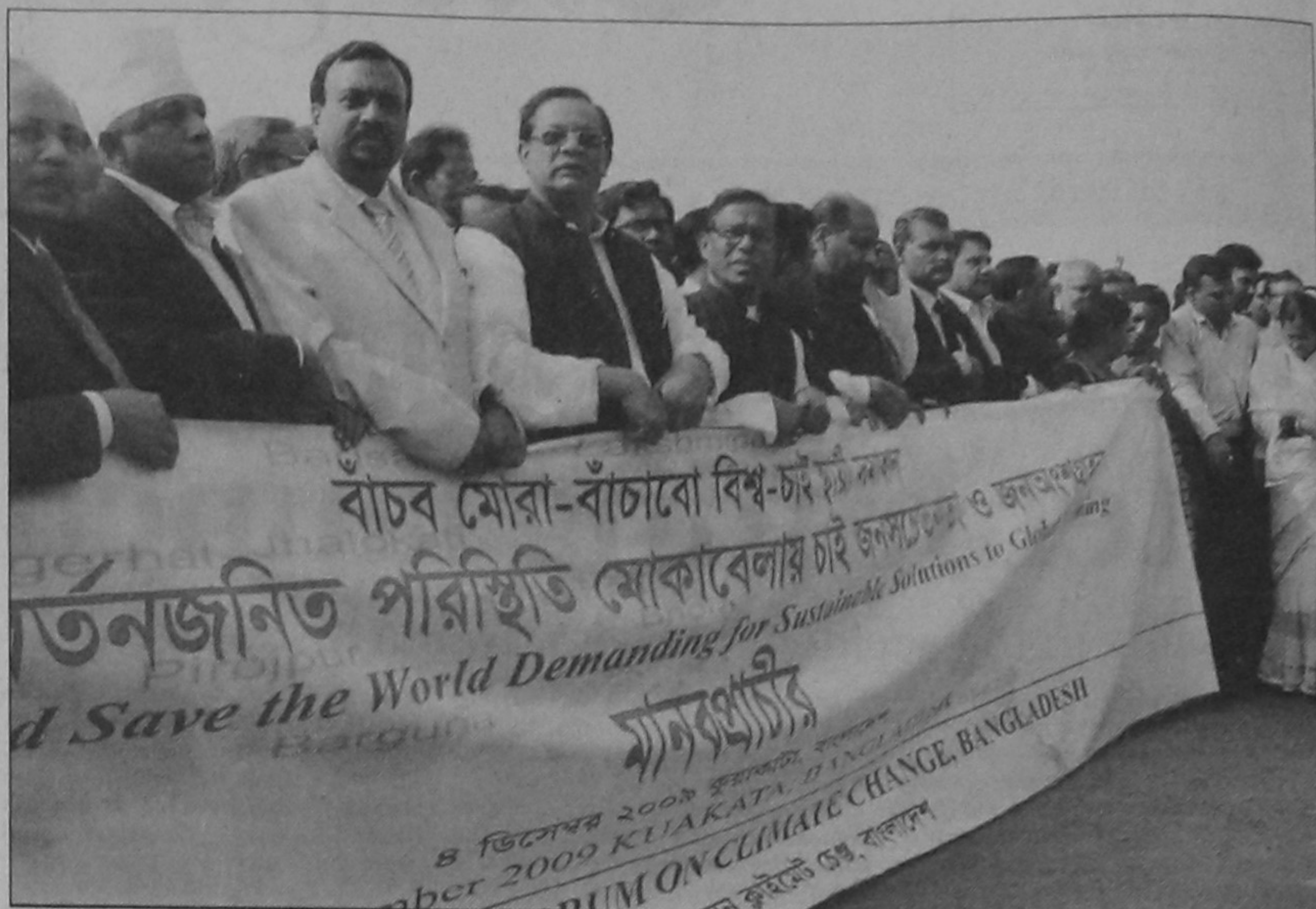
Parliament Members' Forum on Climate Change forms a human chain at Kuakata beach in Barguna yesterday demanding steps to offset the impacts of climate change. (Story on Page 1)