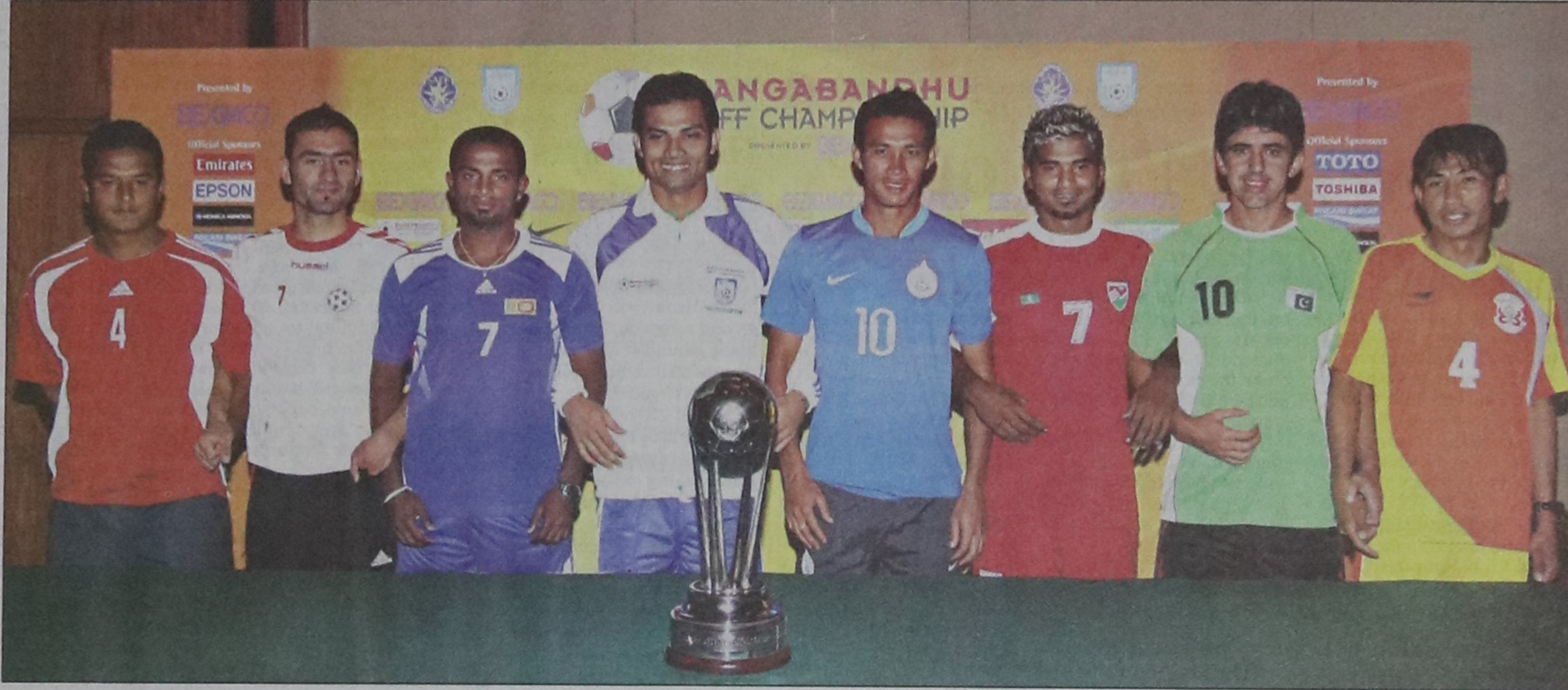
WHO WILL LIFT THE TROPHY COME DECEMBER 13? Captains of the eight participating nations stand with the SAFF Championship Trophy at Sonargaon Hotel yesterday, on the eve of the regional football carnival that kicks off at the Bangabandhu National Stadium today.

Sri Lanka take on Pakistan in the day's first match which will kick off the proceedings.