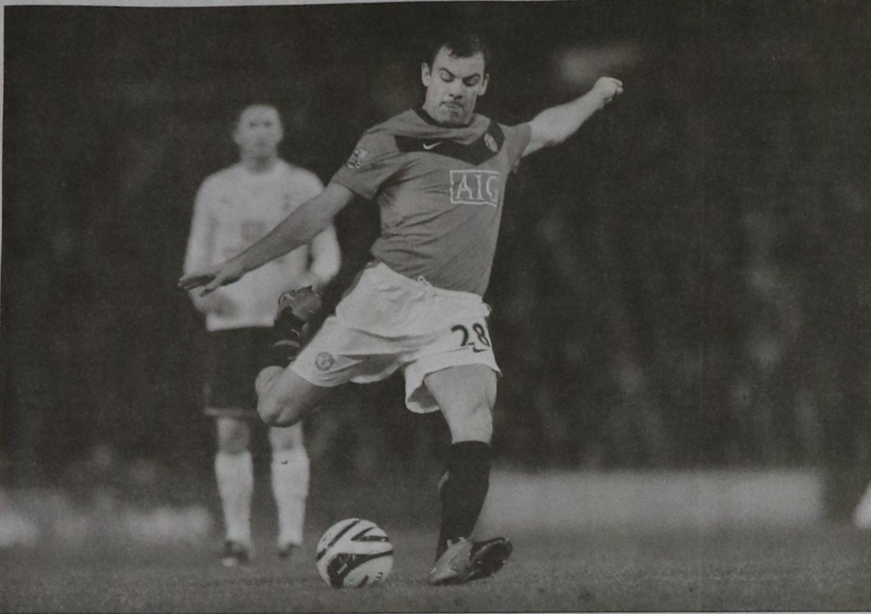
Manchester United midfielder Darron Gibson (R) is about to score one of his two goals against Tottenham Hotspur during their English League Cup encounter at Old Trafford on Tuesday.