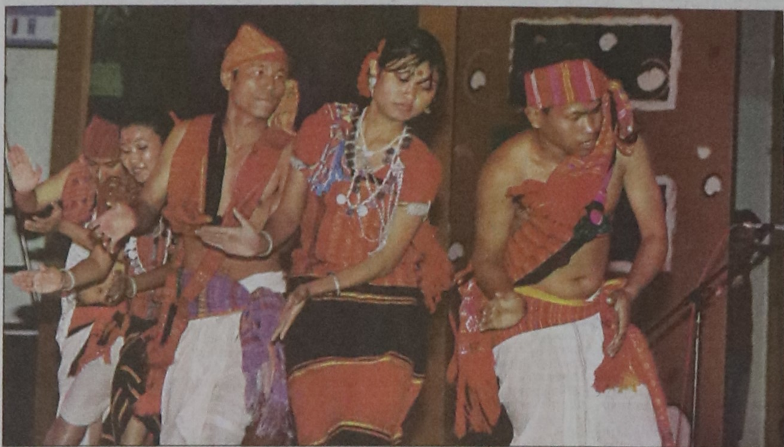
Indigenous artistes perform dance at a cultural function at Bangabandhu International Conference Centre in Dhaka yesterday. CHT Development Facility and UNDP jointly organised the programme to mark the 12th anniversary of CHT Peace Accord.