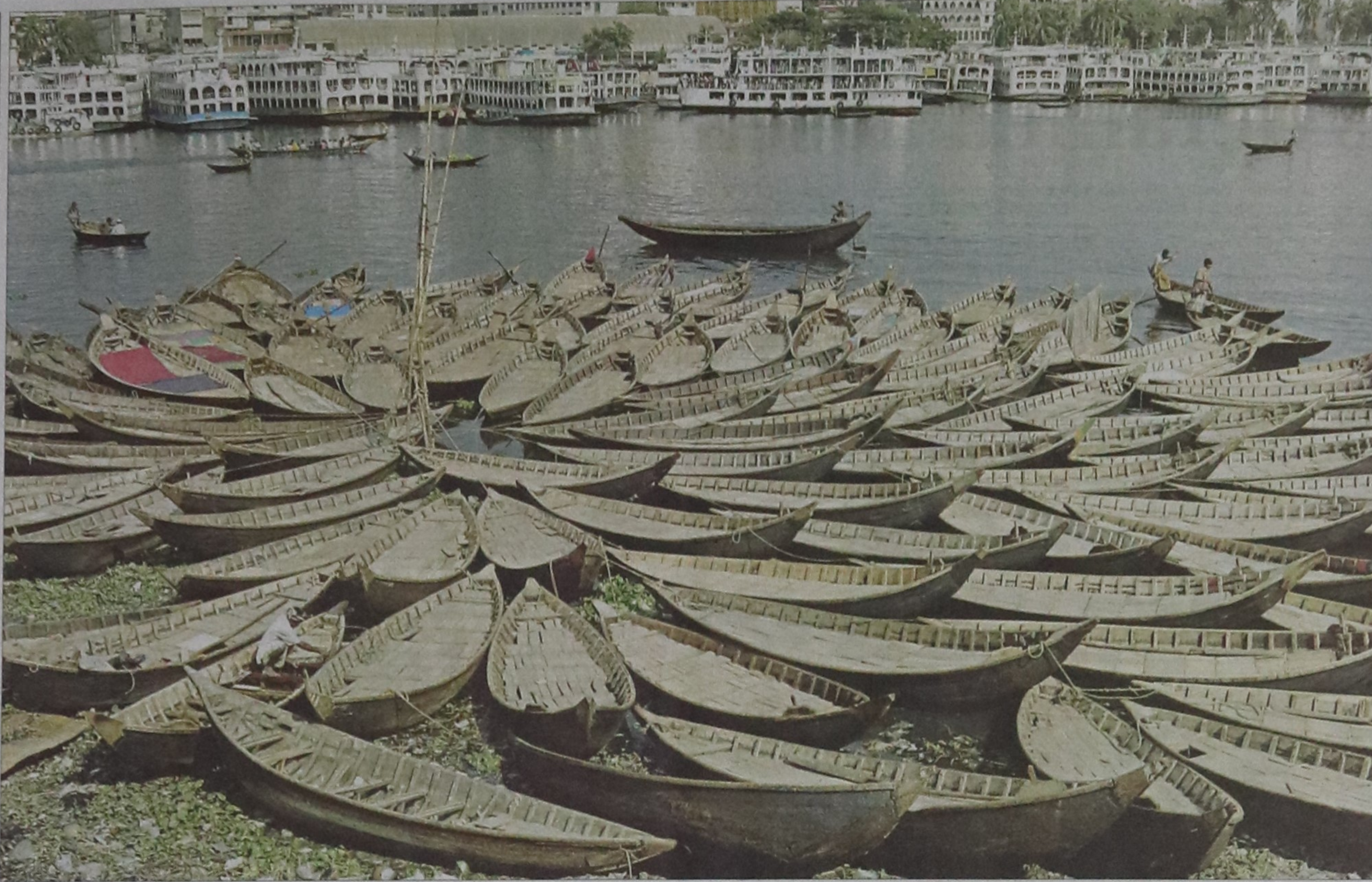
Country boats remain idle at Jinjira ghat at Keraniganj on the outskirts of the city as the people are still in holiday hangover after the Eid-ul-Azha. The photo was taken yesterday.

Reportedly, the wholesale felling of the trees was carried out with instructions from some local influential people who would like to set up three to four ship breaking yards at the clear cut section of the forest.