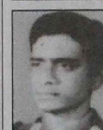
Today is the 38th death anniversary of Shaheed Lieutenant Badiuzzaman Bir Pratik, says a press release.

Badiuzzaman was killed during a battle with the Pakistani occupation forces at Azampur of Akhaura on this day in 1971.