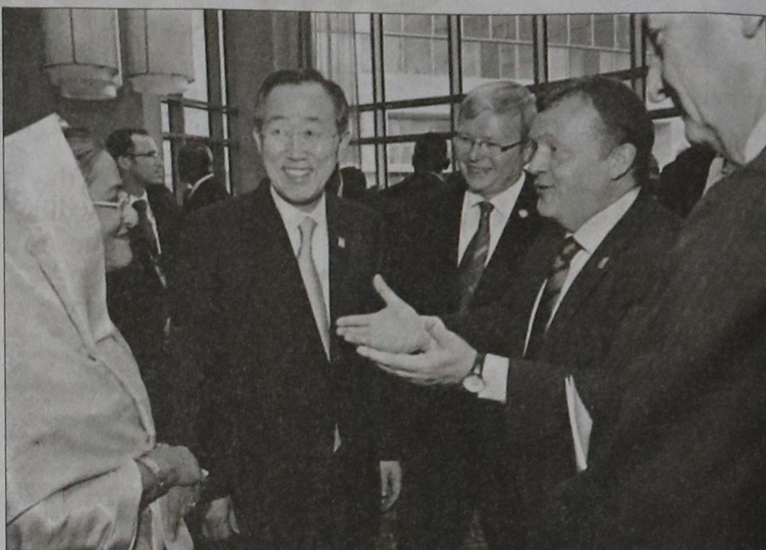
Prime Minister Sheikh Hasina talks with UN Secretary General Ban Ki-moon and others during an executive session of the Commonwealth Heads of Government Meeting (CHOGM) in Port of Spain on Friday.

The centre will operate on the basis of public-private partnership with specified commercial goals and seek to achieve pre-determined time-bound sales targets. In all, BTC will strive to establish itself as a successful trade mission of Bangladesh abroad.