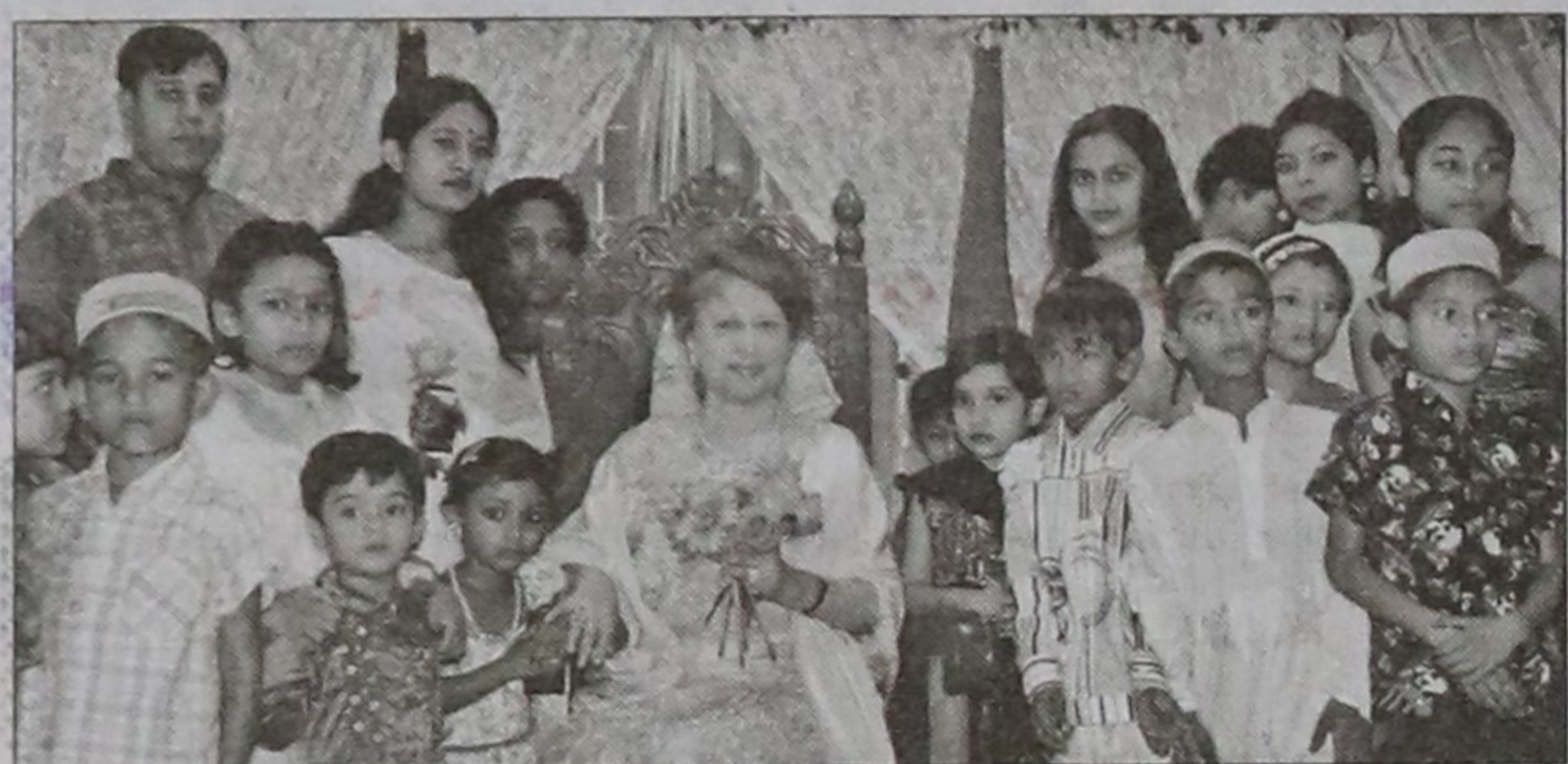
BNP Chairperson Khaleda Zia exchanges Eid greetings with children at the Ladies Club in the city on Eid day. She also exchanged Eid greetings with foreign diplomats, former bureaucrats and party leaders and activists.

"However, we will have to admit that there are shortage of doctors and nurses in health facilities and that the authorities are yet to approve recruitment of more doctors and nurses. If more doctors and nurses could be recruited soon, services in the hospitals would certainly be improved even during long vacations," he added.