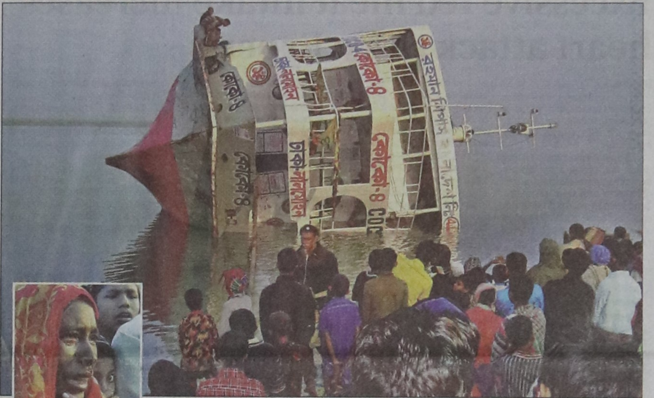
Relatives and friends of victim passengers of MV Koko-4 wait along the banks of the river Tentulia near Nazirpur launch terminal. Overloading by operators made this lady [inset] sacrifice much more than she had ever thought of.