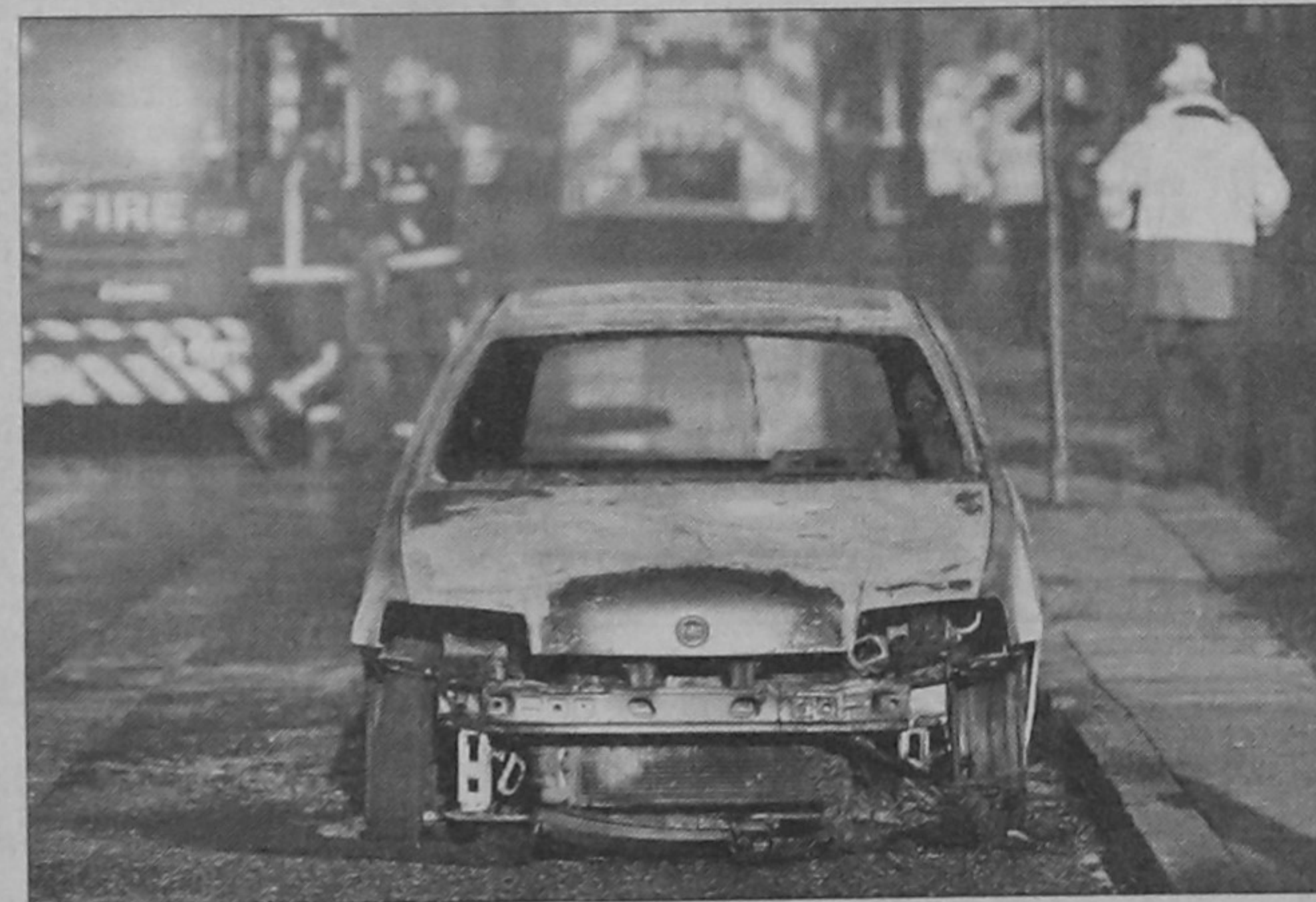
A burnt out car is pictured at the scene of a blaze in Peckham, in south east London yesterday. Around 310 people had to be evacuated on Thursday after a fire at a building site spread to nearby flats in south London.

Around the size of a small plane, ARES will be folded into a rocket and launched to the red planet. It would be the first aircraft ever to fly over another world.