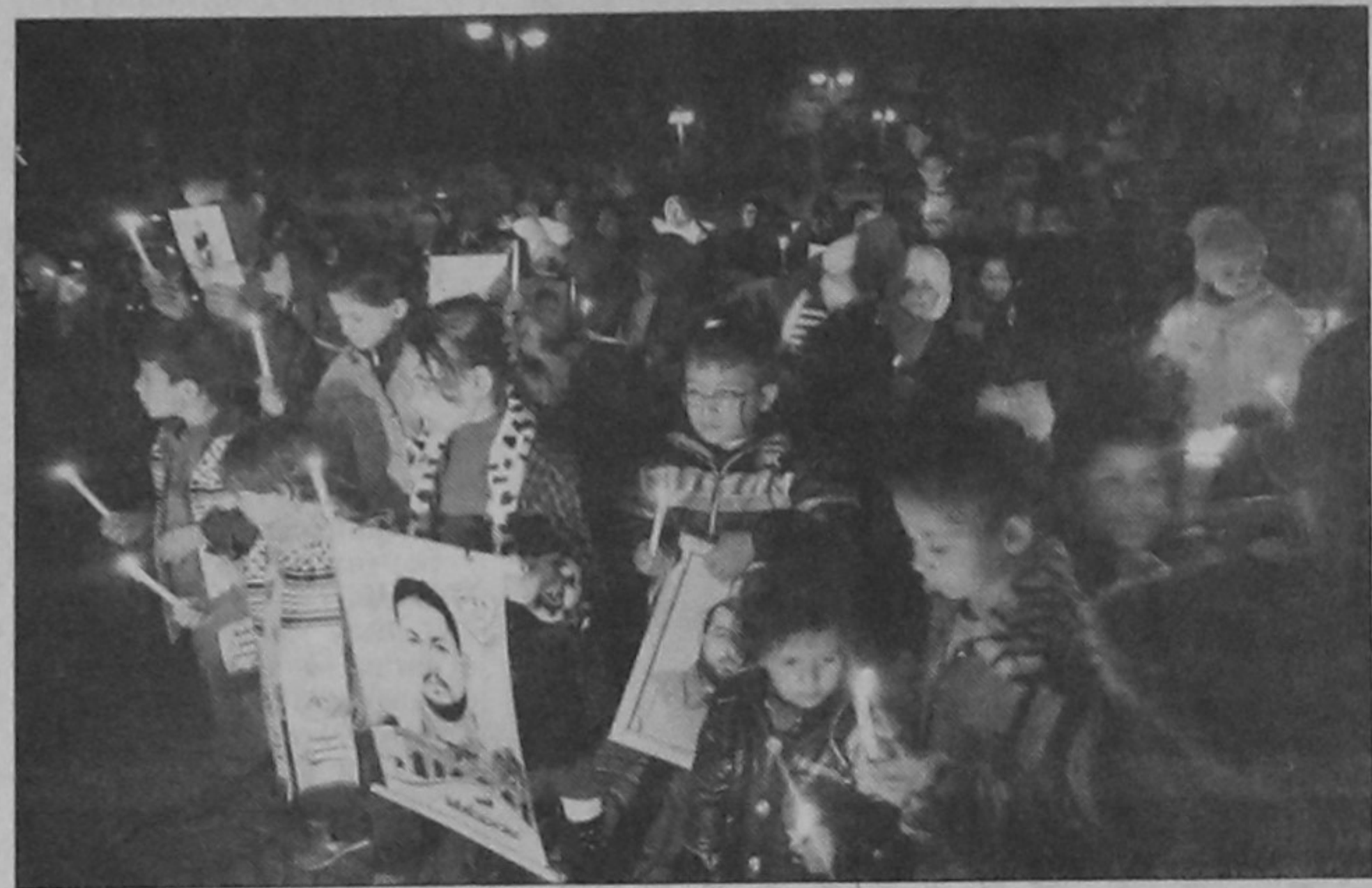
Palestinian children take part in a candle-light vigil in Gaza City on Wednesday to call for the release of Palestinian prisoners held in Israeli jails.