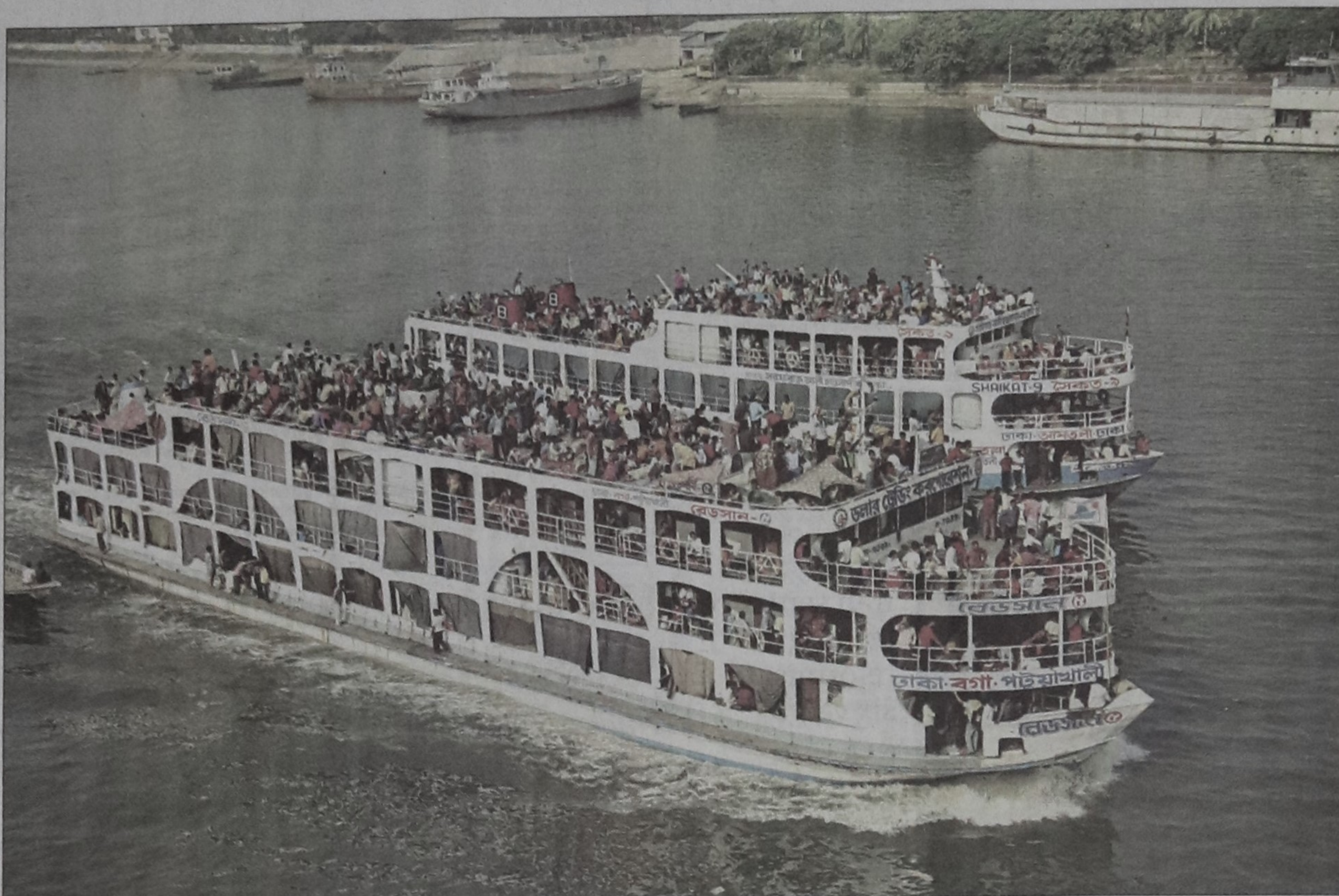
Risking their lives, people cram into a launch to go home to enjoy Eid holidays with their near and dear ones. The picture was taken from First Buriganga Bridge at Postagola yesterday.

Secretaries concerned of the president office were present during the meeting.