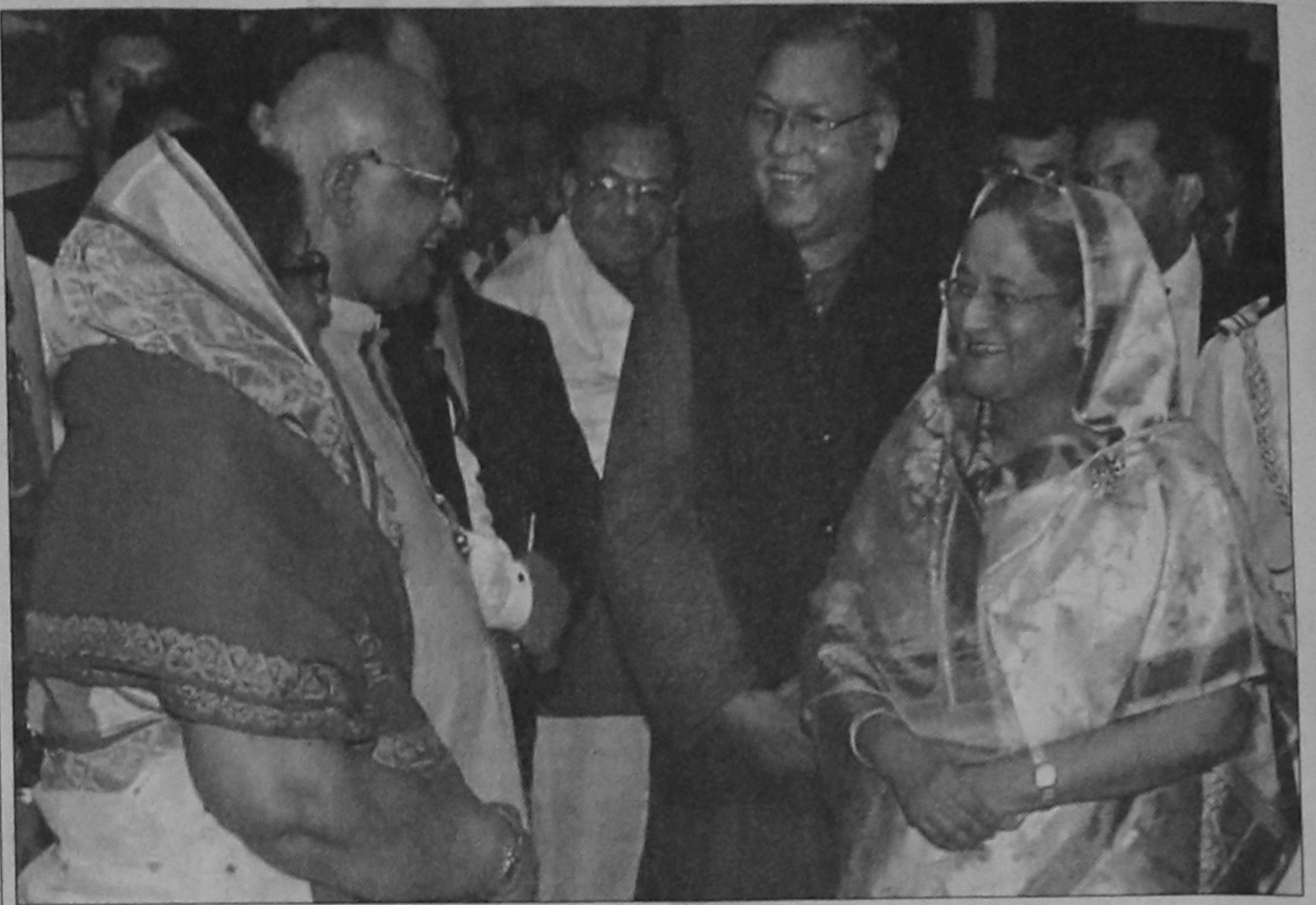
Deputy Leader of the House Sayeda Sajeda Chowdhury, Chief Whip Abdus Shahid and Finance Minister AMA Muhith see off Prime Minister Sheikh Hasina at Zia International Airport in the city on Wednesday prior to her departure for Port of Spain in Trinidad and Tobago where she will attend a meeting of the heads of state of the Commonwealth countries.

Tobarak Hossain said influential people with the connivance of local land officials had occupied these lands, and that even the land officials themselves illegally occupied a large portion of the vested property.