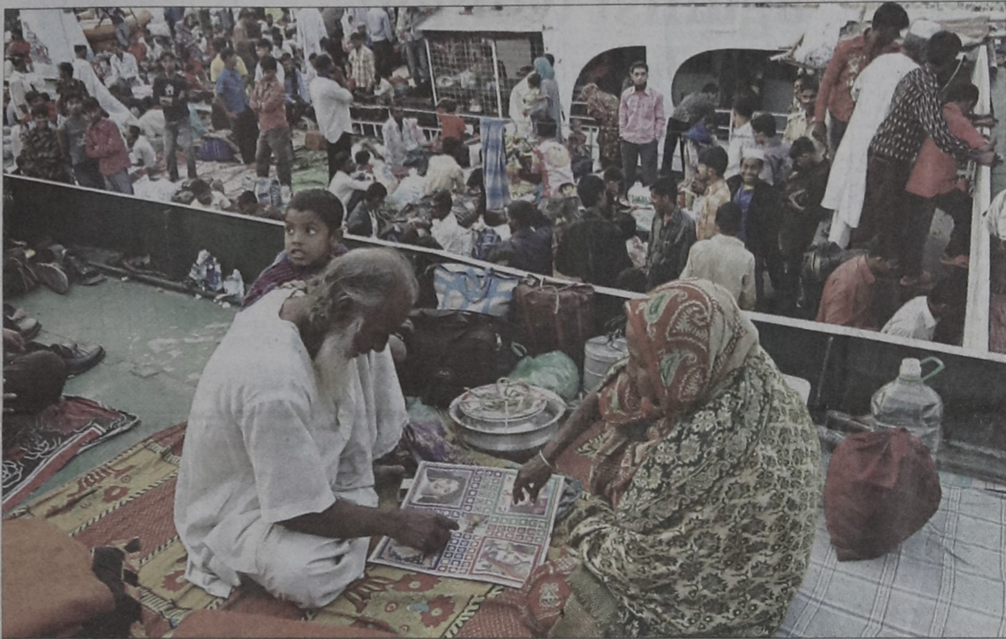
With some space available on the deck in the thick of congestion, these brother and sister found an innovative means of pastime [playing ludo] on their way home for Eid-ul Azha.