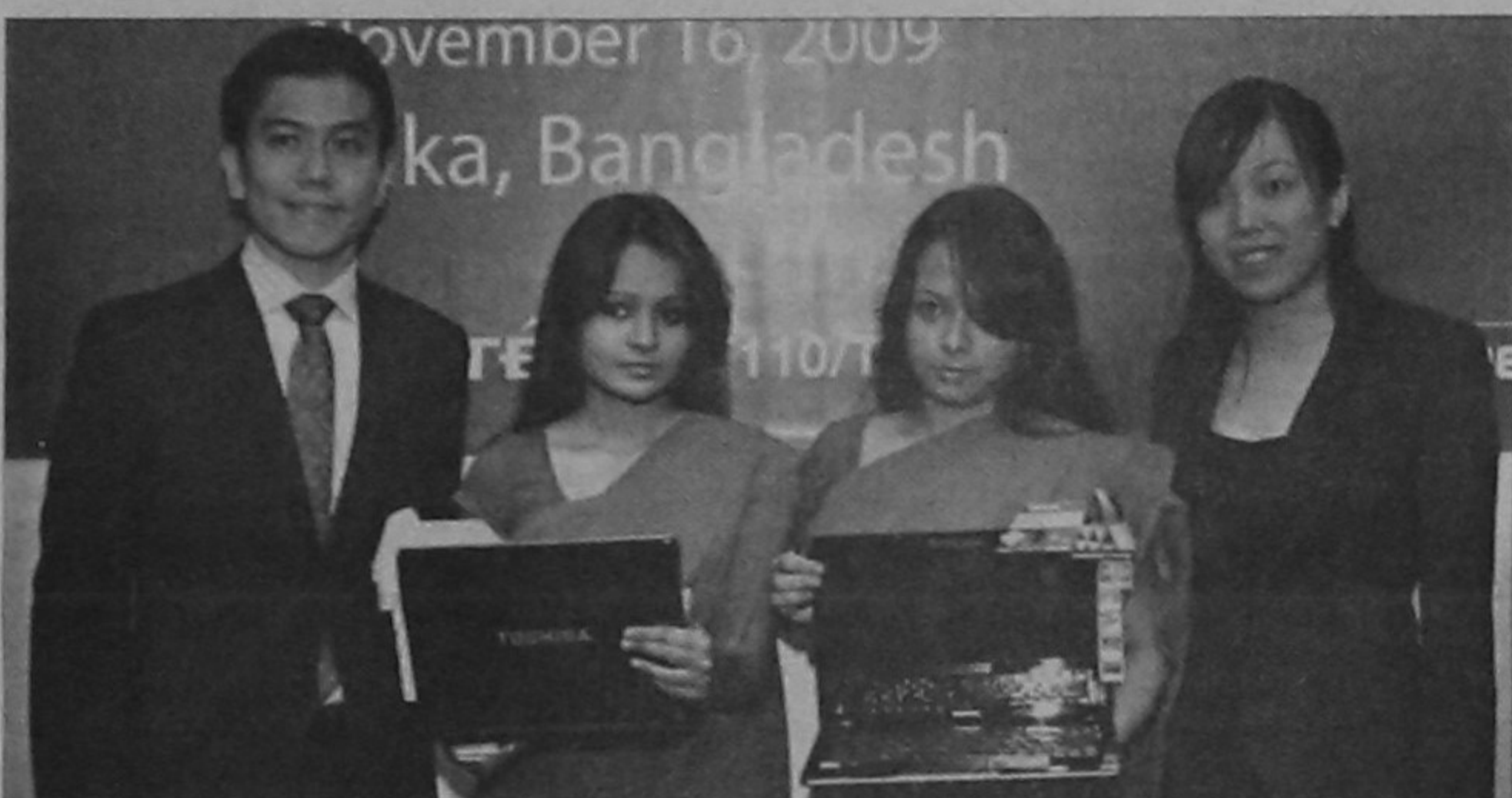
Models display the PORTÉGÉ T110 and T130, the latest notebooks from Toshiba Singapore Pte Ltd, at a launching programme in Dhaka recently. The new PORTÉGÉ laptops come with a power-efficient, mercury-free led backlit display and RoHS compatibility.