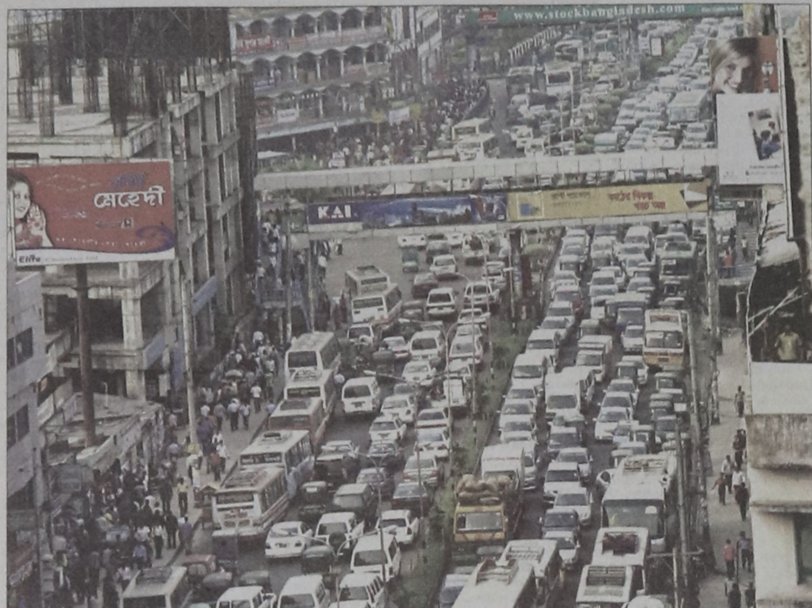
On the second day of using automated signalling system, traffic congestion worsens further all over the city just like this photo showing an unending gridlock on Kazi Nazrul Islam Avenue yesterday.

For More Information: 8855366-6, 01712 685483